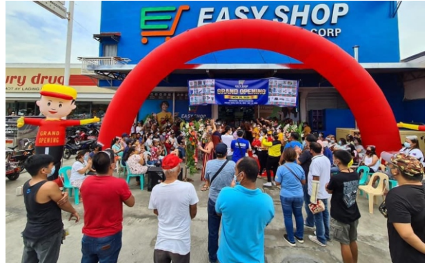
Grand Opening of EASY SHOP Shopping Center at Barangay Magdiwang, Noveleta, Cavite! Another new establishment here in our town! Shopping na!! More Business means More JOBS!! Tuloy Tuloy ang UNLAD NOVELETA! #JobsJobsJobs #TrabahoParaSainyo #unladNoveleta #MaunladnaBayan #MaunladnaMamamayan