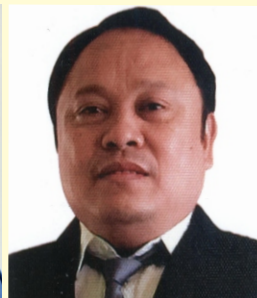
Mactan Customs Coll. Campo