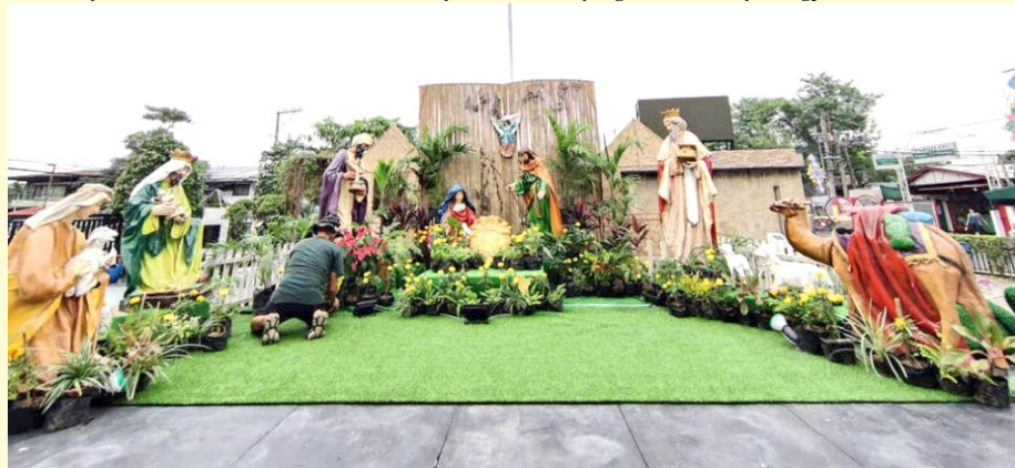
Hangad natin na maging paalala ang Belen sa tunay na diwa ng Kapanganakan ng ating Panginoong Hesu-Kristo. Samahan niyo kami mamayang 6:00 ng hapon dito sa ating Facebook Page. Hindi na kailangang lumabas pa, dahil dadalhin natin ang ating munting programa sa inyong mga tahanan. Magkita-kita tayo! #PaskuhanSaImus2020 #MaliksingImus #IMUSamasamaTayo #MahalKongImus