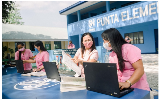
Teachers prepare for their lessons using the laptops from SM Foundation.