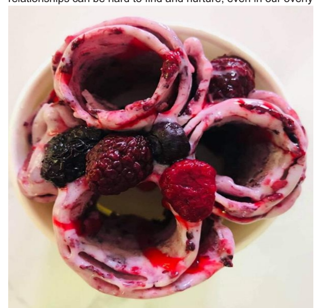
PERFECT COMBINATIONS AT SM CITY BACOOR, CAVITE - Our Festive leason Treat is still ON so don't miss the chance to enjoy the pleasure of our fantastic combinations! Visit Dreiland Ice Cream at the Lower Ground level of

Truly, we all long for genuine relationships, but these relationships can be hard to find and nurture, even in our overly