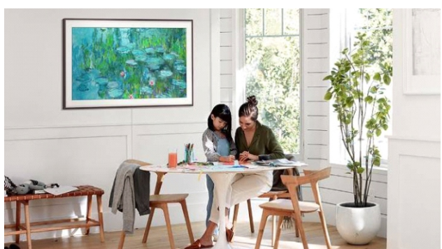
nes art with this amazing Samsung 55" QLED 4K Flat Smart TV

Get connected with Samsung Galaxy A71 smartphones and enjoy all your favorite apps, social media, games, entertainment