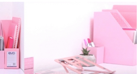
Pretty in pink notebooks and organizers.

The desk organizer set collection is available at selected SM Stationery section of the SM Stores. Also, SM Stationery is now online on www.smstationery.com.ph and with the SM Store's #143SM Call to Deliver services. You can now have your home office must-haves delivered right to your doorstep. Follow SM Stationery PH in Instagram and Facebook and join their Viber community for more details and info.