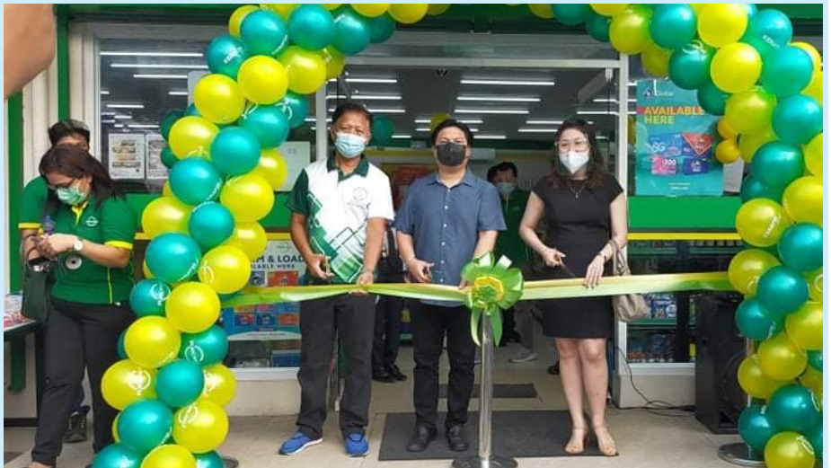
Grand Opening of PUREMART (Puregold Mini-Mart) Located at Barangay Salcedo 2, Noveleta, Cavite! Sa gitna ng pandemiya, Tuluy Tuluy parin ang Unlad Noveleta! More Business Means More JOBS! #unladnoveleta #JobsJobsJobs #TrabahoParaSainyo #Puregold #Puremart