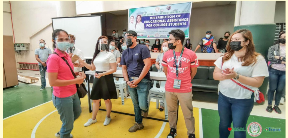
4 Batches Done: Distribution of College Educational Assistance. Nakita ko ang mga batang nagsusumikap para sa kanilang pangarap. Wag susuko. Aral mabute mga anak. Mag oopen na din po tayo ng schedule ng COLLEGE EDUCATIONAL ASSISTANCE from 2021 FUND. Announcement will be posted, soon. Be blessed. Be a blessing. ♡MGBL

Remember, you may choose your sin, but you cannot choose the consequences.