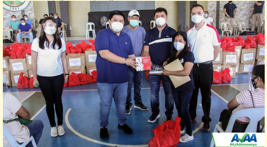
Bilang pasasalamat sa ating mga Modern Day Heroes, namahagi po tayo ng blood pressure devices, nebulizer at groceries sa mga Barangay Health Workers at Barangay Nutrition Scholars. Inumpisahan po ang programang ito sa pag aalay ng panalangin mula sa mga Pastor ng lungsod. Ito po ay naisakatuparan sa tulong ng Team AJAA kasama ang ating mga panauhing pandangal na sina Cong. Peter Cayetano at Congw. Lani Cayetano. Maraming salamat po sa pag bisita niyo dito sa Imus.