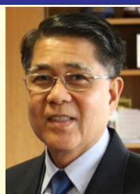
BOC Commissioner Rey Leonardo B. Guerrero

Commissioner Rey Leonardo B. Guerrero again commended the efforts of the men and women of the BOC who, despite the risk to their health and safety, showed their unwavering commitment and dedication to service. [DEL O. PAR]