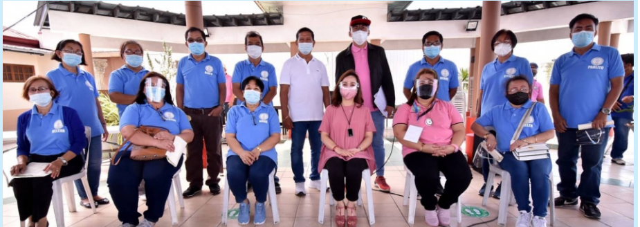
OATH-TAKING of Golden City Dasma 3 HOA of Barangay Salawag, Robinsons Vineyard Phase 2 HOA of Barangay San Agustin 1, Acacia Homes HOA of Barangay Bural 3, Diamond Village HOA of Barangay Salawag and Emerald Crest HOA of Barangay San Jose.