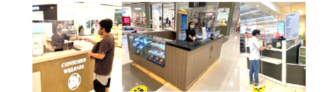
The Consumer Welfare Desk located at the SM Supermalls are accepting payment for SSS and Pag-ibig contributions as a side service for customer's convenience. Prepaid cards and e-loads are also available here.