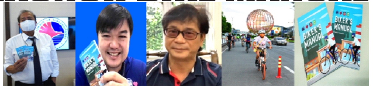
DOTr Secretary Arthur Tugade with the English and Filipino version of the DOTr-SM bike manual. The manual aims to promote safety, courtesy and etiquette on the road among cyclists, motorists, and pedestrians.

Servicio has 25 outlets located at SM Supermalls. You can also avail of select services offered at The SM Store Customer Service, SM Mall's Info Booth, Consumer Welfare Help Desk located at SM Malls, SM Markets - Supermarket, Hypermarket and Savemore, and Waltermart.