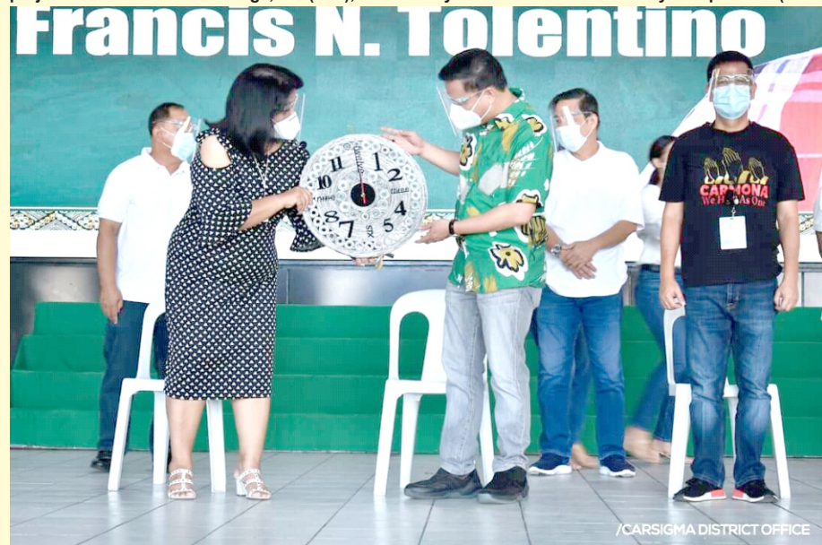
Kahapon, katuwang ang Lokal naPamahalaan ng Carmona at DSWD IV-A, pinangunahan ni Senator Francis Tolentino ang pamamahagi ng tulong pinansyal sa 500 residente ng bayan ng Carmona. Sa ngalan ng mga mamamayan ng Ikalimang Distrito ng Cavite, taos puso ang pasasalamat namin sa inyo, Senator Francis Tolentino. Maraming salamat sa malasakit sa ating mga kapwa Kabitenyo!

TRCE MARTIRES CITY, Cavite (PIA) – The Toll Regulatory Board (TRB) recently inspected the operational segments and upcoming section of the Cavite Laguna Expressway (CALAX), one of the road infrastructure projects of the MPCALA Holdings, Inc. (MHI), a subsidiary of the Metro Pacific Tollways Corporation (MPTC) in partnership with the Department of Public Works and Highways (DPWH).