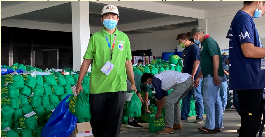
Maraming salamat po sa ating mga Bantay Bayan at sa mga bumubuo ng ating mga barangay sa isang buong taon po nating pinagsamahan. Kami po ay taos pusong nagpapasalamat sa inyong serbisyo at sakripisyo para sa ating mga kababayan. Saludo po kami sa inyo!