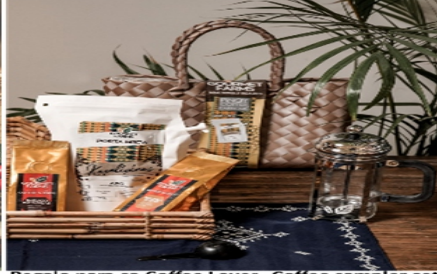
Regalo para sa Coffee Lover. Coffee sampler set from Gourmet Farms featuring premium beans from around the Philippines. The set includes Baraco Batangas coffee, Maynila Blend, Apo Coffee from Davao, and a lovely French press, encased in a reusable plastic bayong.

Gifts of wellness from our fields and forests – coconuts, rice, and nuts are not only delicious and nutritious – but make us happy and healthy. Shop from home with Kultura's Regalo Catalog! Check out our catalog here https://bit.ly/RegaloByKultura2021 and simply contact our personal shoppers to order. The Regalo Collection is available at Kultura Stores. You can also shop thru Kultura's Website: http://www.kulturafilipino.com or thru Call to Deliver 0917-5174096 / 0967-6093407. Kultura ships here and abroad.