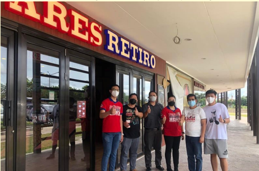
Inaanyayahan ko po kayo sa pinakabagong kainan sa Verdant Strip! Para sa mga gustong mag-food trip, try ninyo ang Pares Retiro sa opening day nito bukas. Ngunit huwag pa rin po nating kalilimutan na mahigpit pa ring sumunod sa minimum public health standards.

DASMARIÑAS, Cavite – The local government unit (LGU) here is prohibiting Christmas caroling as part of local guidelines to prevent the spread of the coronavirus disease (COVID-19).