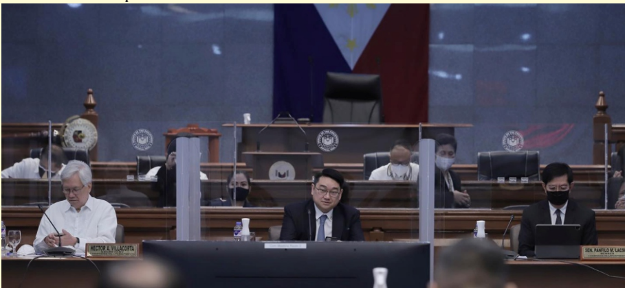
Disyembre 15, 2021: Tayo po ay nasa senado upang pangunahan bilang Chairman ng Committee on National Defense ng Commission on Appointments, ang pagdingin at pag-abruba ng promosyon ng 21 General and Senior Officers ng Armed Forces of the Philippines. Kasama po natin sila Senate President Tito Sotto, Sen. Ping Lacson at Sen. Bato dela Rosa para sa huling hearing na ito ng Commission on Appointments para sa taong 2021.