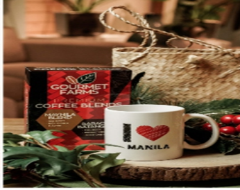
Gourmet Farms premium coffee blends and mug set.