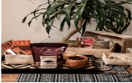
Regalo para sa Chocoholics. Choose from Kultura's world class artisanal chocolates beautifully packaged bars in interesting flavors for adventurous tastes, made with (low-glycemic!) coco sugar for the health-conscious, or even award-winning premium chocolate for the most refined palates. Can't decide? The hot chocolate and mug sets are always a hit!

includes Regalo para sa Pamilya at Tahanan for the home and family members, and Regalo para sa Barkada at Katrabaho for colleagues and friends. Give a taste of the Philippines by creating your own Regalo para sa Pinoy Foodie, and Regalo para sa Coffee Lover at Chocoholic with award winning artisanal chocolates . . . gourmet coffee blends . . . and healthy snacks made from local fruits and vegetables