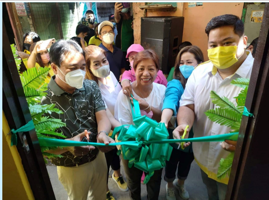
BLESSING AND INAUGURATION OF NEWLY CONSTRUCTED MULTIPURPOSE HALL OF PUROK 9, SAMPALOC SITE II, BARANGAY BF HOMES June 3, 2022 - A priority project of the people of Parañaque headed by Parañaque City Mayor Edwin L. Olivarez, Vice Mayor Rico Golez, Congressman Eric L. Olivarez and Parañaque City Council in coordination with Barangay BF Homes and Purok 9 of Sampaloc Site II. Congratulations! Mabuhay po tayong lahat! #SaDiyosSaTaoSerbisyoTotoo #sErbisyoLangPO