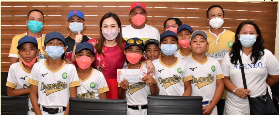
LITTLE LEAGUE Softball Courtesy Call