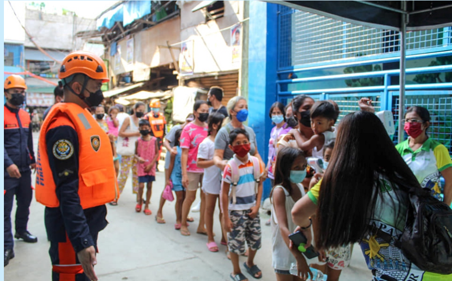
BDRRMO Flood Drill Simulation Exercise @Panapaan V, Bacoor City, Cavite.