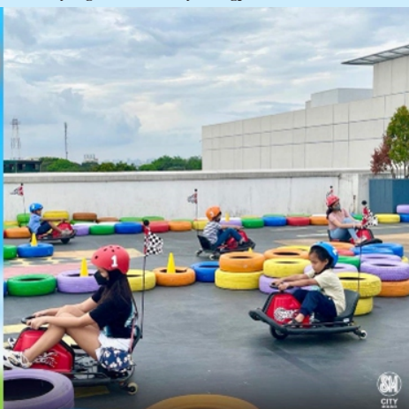
SUMMER COLOR DRIFT DRIFTITO GIVEAWAY AT SM CITY MOLINO, CAVITE - SUMMER FUN continues at SM City Molino because FREE ticket pass on the Summer Color Drift awaits you! Just follow SM City Molino on our TikTok www.tiktok.com/@smcitymolino and share the post tagging 3 of your friends and family you wanna invite on a DRIFT DATE and make sure they follow SM City Molino too! Comment the hashtag #AweSMBurstOfSummer and your TikTok account when DONE. There will be three FB winners to be randomly selected to win 4 FREE DRIFT tickets. Winners will be announced on June 10, 17 and 24, 2022 on SM City Molino's Facebook page. Join now!