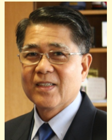
BOC Commissioner Rey Leonardo B. Guerrero

Despite this performance, the Bureau maintained its border security measures against undervaluation, misdeclaration and other forms of technical smuggling and collect lawful revenues. Commissioner Rey Leonardo B. Guerrero commended the efforts of the District Collectors and the Men and Women of the Bureau of Customs who, despite the risk to their health and safety, showed their unwavering commitment and dedication to service.