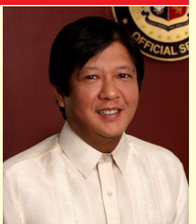
President Elect Bongbong Marcos

Pres. Bong Bong Marcos Jr. said "I was not in charge then. Now that I'm in charge, that should be no more."