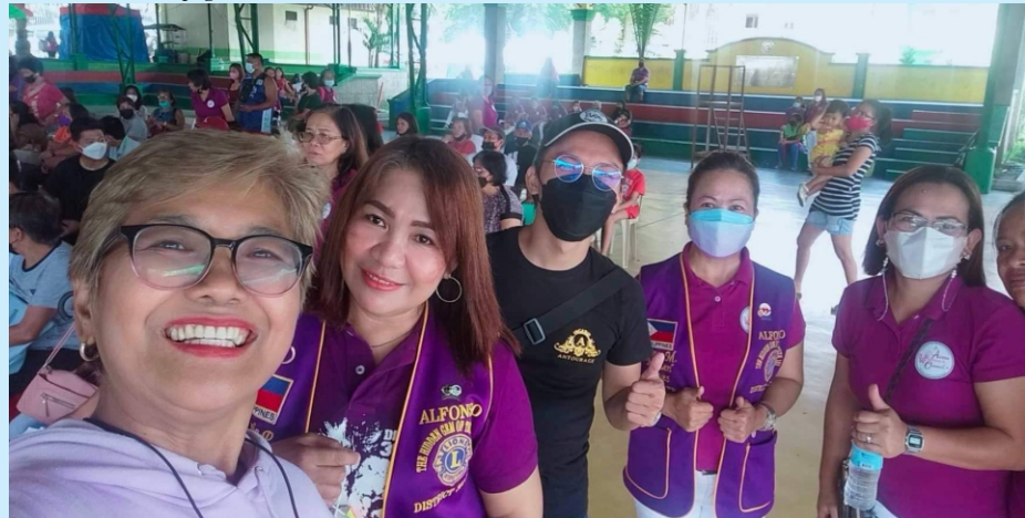
Ang ALFONSO WOMEN'S COUNCIL (AWC) kaagapay po ng ANTOURAGE INC. at suportado rin ng mg volunteer members ng ALFONSO, THE HIDDEN GEM OF THE SOUTH LION CLUB INT'L ay nagsagawa po ng FREE MEDICAL EYE CHECK-UP and PRESCRIPTION GLASSES with the theme: "SAMA-SAMA PARA SA DAANG MALINAW" MEDICAL MISSION 2022 noong katapusan ng Mayo 2022. Maraming salamat po sa pagkakaisa upang maisakatuparan ang programang ito. Tuluy-tuluy po ang ating #ResponsablengSerbisyo