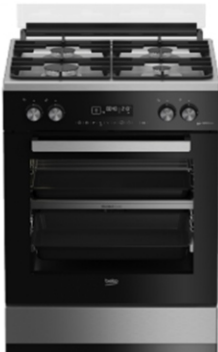
This Beko Range (FVR62630XDTL) features 4 special burners and a multifunctional oven for a faster and more efficient cooking experience.