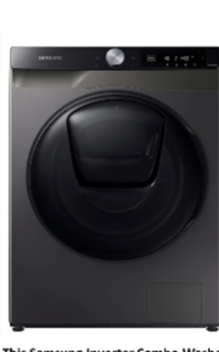
This Samsung Inverter Combo Washer Dryer Washing Machine features an eco-bubble, an air wash and AI control technology that cleanses your clothes easily and effectively with superb laundry care.