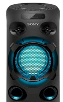
High performance Sony V02 One Box Audio System with Bluetooth technology for your favorite music playlist.

SMDC Wind Residences is an hour's drive south of Manila into the lushness of Tagaytay. Experience a vacation within your own condo at SMDC Wind Residences as you enjoy the country club amenities like the clubhouse, indoor and outdoor swimming pools, tennis court, and basketball court. In addition, the signature 5-star amenities in Cool Suites Tagaytay located also in Wind Residences makes it a perfect holiday home for those who enjoy cool winds and cozy weather.