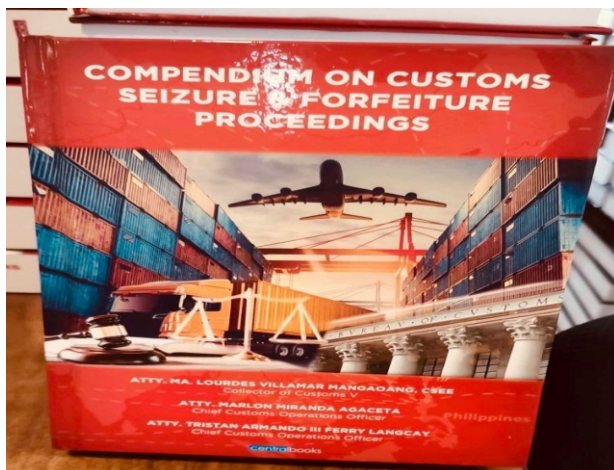
You can avail this customs book at Central Bookstore Website or you can buy the book at the Central Bookstore Quezon Avenue, Quezon City.