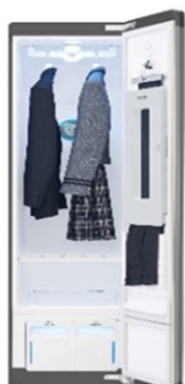
This innovative LG Inverter Styler sanitizes clothes up to 99.9%.