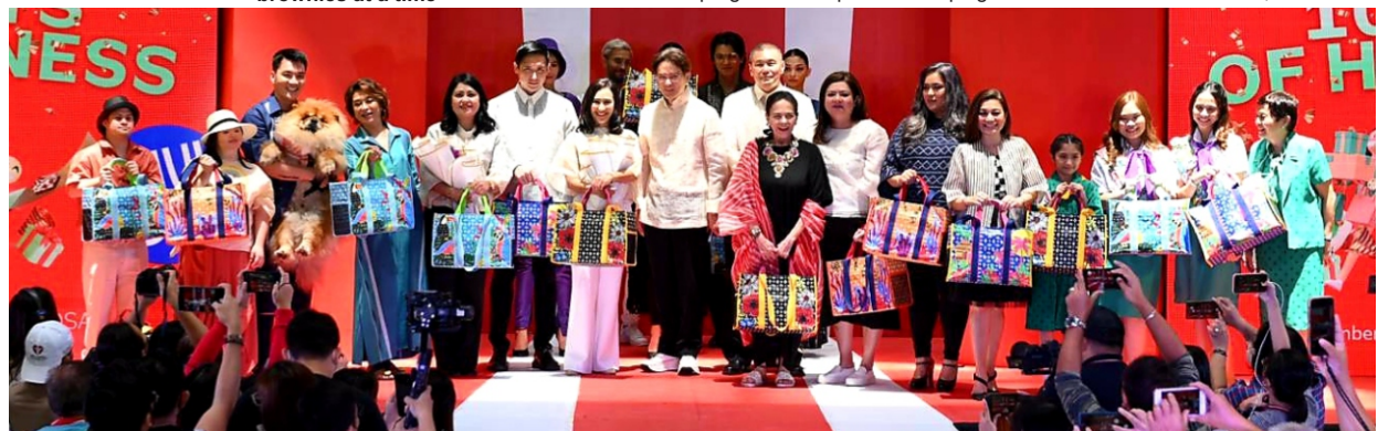
In photo: men and women of substance from the Quezon City LGU, SM Supermalls, Girl Scouts of the Philippines, Brownies Unlimited, Spark PH, and Down Syndrome Association of the Philippines