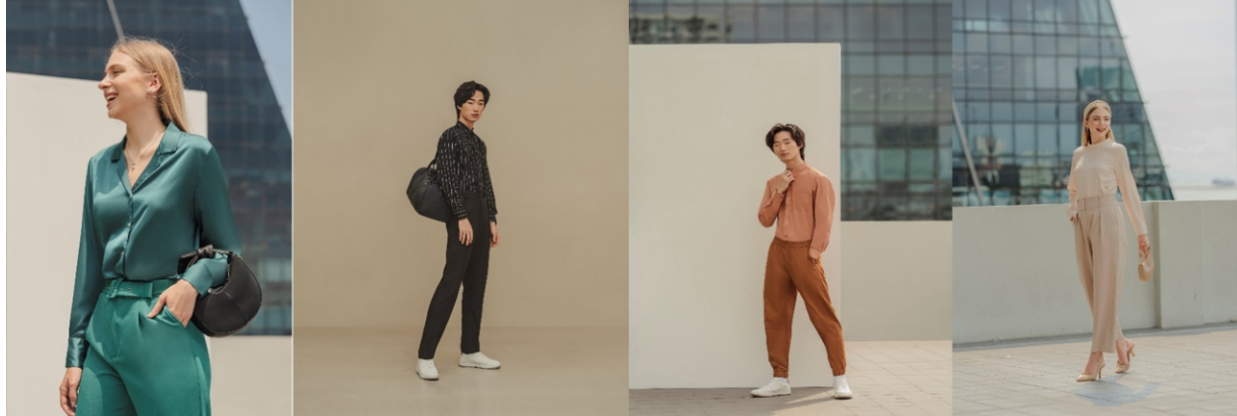
1. Minimalist memo. Monochromatic satin blouse and pants from SM Woman paired with Raya jewelry and a Parisian bag. 2. Corporate basics – a dress shirt and slacks available at SM Store's Men's Department. 3. Contemporary classics. Mainstreet shirt, Baleno pants, Salvatore Mann Bag and Milanos shoes from SM Store's Men's Department. 4. Dress up for work wearing different pieces together that fall within the same color from the SM Woman Department.