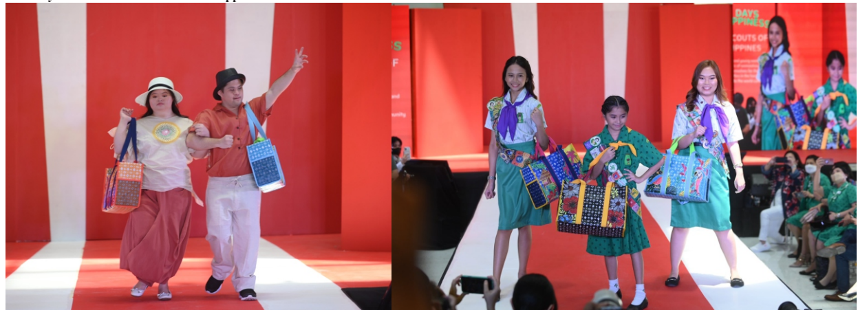
Members of the Down Syndrome Association of the Philippines, Inc. and Girl Scouts of the Philippines come together to spread the holiday cheer.

able to help the environment by upcycling 70 tons of election tarpaulins that we've collected," said Mayor Belmonte.