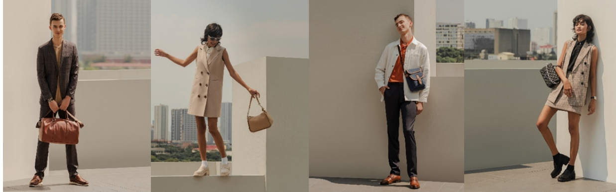
1. Smart and Preppy. Main street blazer, pants, and Baleno tee paired with a Salvatore Mann duffel bag, Hush Puppies loafers and a watch from SM Accessories 2. Boardroom elegance. SM Woman vest dress worn with Antepara eyewear, a Parisian shoulder bag and platform shoes. 3. Cool and casual. Baleno sports shirt, Code Blue jacket, Mainstreet pants, Salvatore Mann Sling bag and leather shoes. All available at SM Store's Men's Department. 4. Dress up for work comfortably and confidently with this SM Woman sleeveless blouse, vest, mini skirt matched with, a Parisian cross body bag and platform shoes, and a watch from SM Accessories.

Check out the new WorkWear at all SM Stores nationwide.