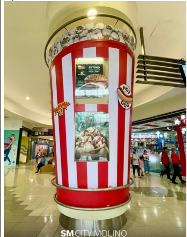
Strike a pose with this Giant Popcorn Bucket at SM City Molino located at the second level near Cinema Lobby. This IG worthy backdrop will surely be a hit for you and your family.