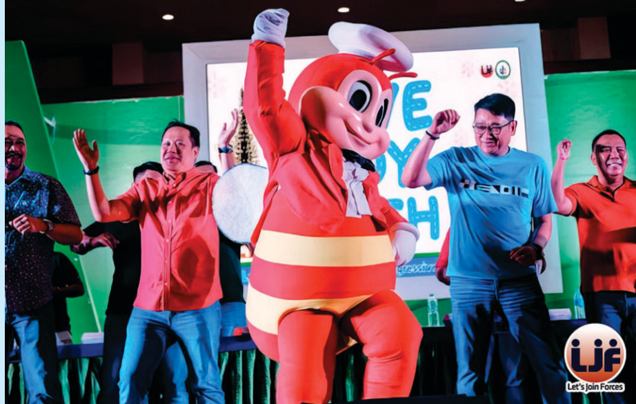
Naging taunang tradisyon na po ng inyong lingkod na ipagdiwang ang aking kaarawan kapiling ang ating mga kababayang Persons With Disabilities (PWDs), upang handugan sila ng saya at konting tulong ngayong panahon ng Kapaskuhan. Isang paraan ko din po ito ng pagpapasalamat, una sa ating Panginoon para sa biyaya ng buhay at sa Kanyang patuloy na pag gabay; pangalawa sa ating mga kababayang Gentriseño sa inyong walang sawang suporta at pakikiisa sa ating magandang adhikain para sa lungsod. Wala po akong ibang mahihiling sa aking kaarawan kundi ang patuloy na Kapayapaan at Kaunlaran sa mahal nating General Trias. Let's Join Forces for a More Progressive City of General Trias! #LetsJoinForces #AlagangFerrerAlagangGenTri