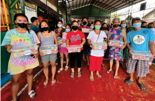
Dasmariñas Residents receive Christmas cheers: SM Cares, together with SM Marketmall and SM City Dasmariñas, shared Christmas Cheers to 300 families of Barangay Buro 1 in Dasmariñas City Cavite.