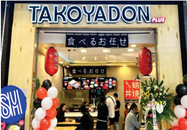
SM CITY MOLINO