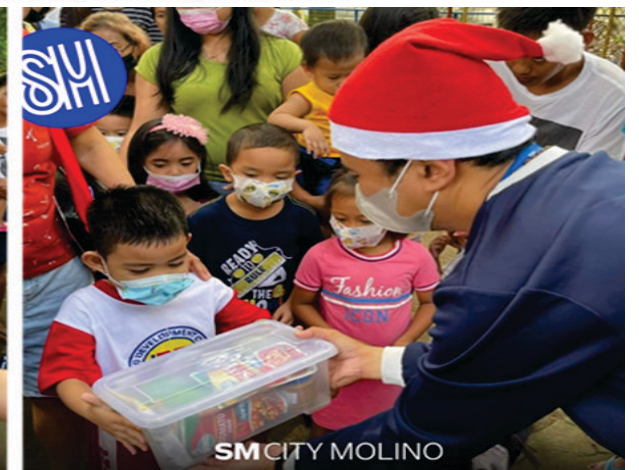
SM City Molino Employee volunteers spreading Christmas Cheers to the children in Brgy. Pasong Buaya 2 Day Care Center