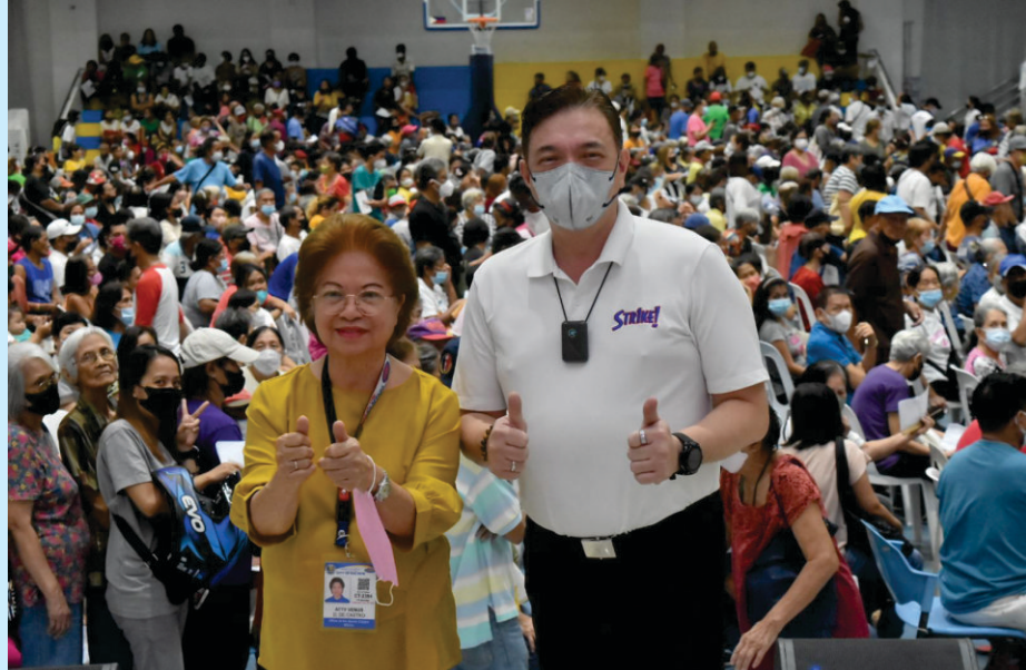
Handog po ng ating pamahalaang lungsod, sa pamamagitan ng City Social Welfare and Development Office (CSWDO) at Office of the Senior Citizens Affairs (OSCA), ang 'Distribution of Social Pension for Indigent Senior Citizens' Ito ay munting pasasalamat sa ating mga lolo at lola, nanay at tatay, sa maraming taon ng kanilang pagmamahal at sakripisyo. #StrikeAsOne #SaBacoorAtHomeKaDito #StrikeSaSerbisyo