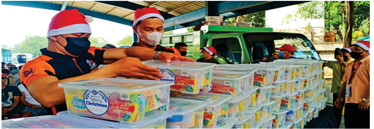
SM City Bacoor CRS SMERT and Agency personnel arranging the Holiday Baskets before distribution.

Indeed, Christmas is more meaningful when we share the blessings to those who need a little cheer for the holiday.