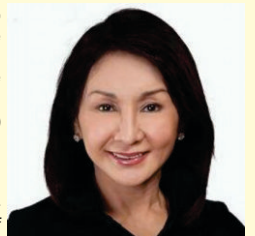
Cebu Gov. Garcia

"If we cannot totally eradicate it, we will make it very, very difficult for these drug turn to page 2