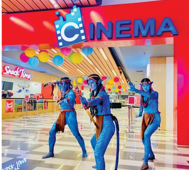
SM CITY TRECE MARTIRES