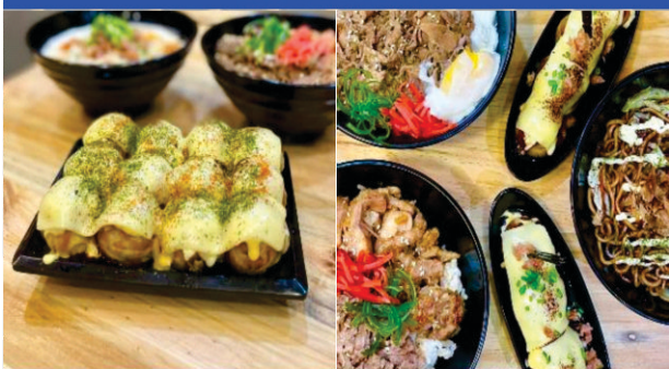
SM CITY MOLINO