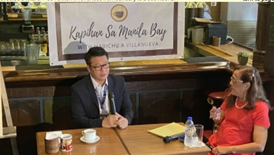
SEIZED SMUGGLED ONIONS. Customs Commissioner Yogi Filemon Ruiz says the bureau is donating the confiscated smuggled onions to Kadiwa store during a press briefing at the Kapihan sa Manila Bay on Wednesday (Dec. 28, 2022). He said there are 500 container vans being held at various ports.

Meanwhile, Com. Ruiz said BOC surpassed its annual revenue target of PHP721.52 billion when it collected a total of P851 billion in revenues from January to December 27. turn to page 7