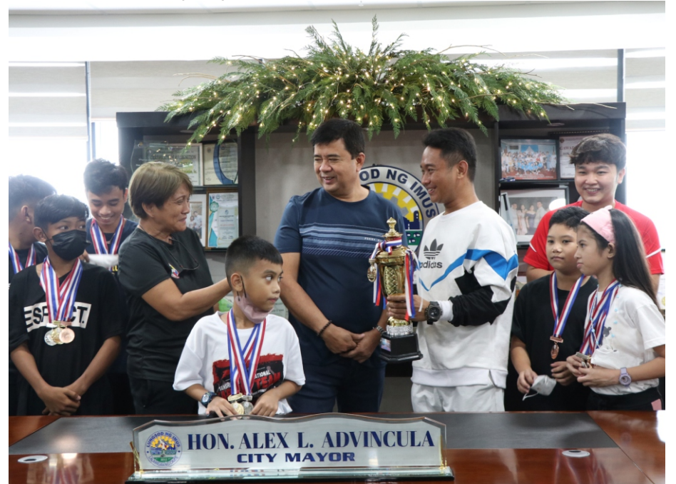
Bagong taon, bagong simula para po sa ating mga kababayang natatangi! Narito po ang mga Imuseñong nagpakita ng iba't ibang galing at nagkamit ng gantimpala. Talaga nga naman pong maipagmamalaki ang talento at husay ninyo! #AAngatAngImus #AlagangAdvincula