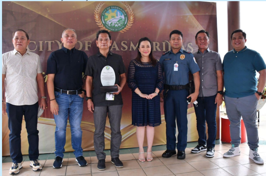
Kinilala at bininyang papuri ang mga opisina o departamentong naging instrumento upang makamit ang iba't-ibang parangal na ginawad sa Lungsod ng Dasmariñas noong mga nakaraang taon. Narito ang summary of awards na kinilala ngayong araw, ika-3 ng Enero taong 2023: - Plaque of Appreciation: Araw ng Parangal sa mga natatanging Kaagapay ng DOH - TRC Bicutan - 2021 Green Banner Seal of Compliance - Top LGU Implementer in Category B - Cities and HUC: CALABARZON Subaybayan Awards - Gawad Kalasag - Seal of Compliance - Plaque of Recognition: 2019 Peace and Order Council Performance Audit - Plaque of Recognition: 2021 Peace and Order Council Performance Audit - Top 10 Most Number of Same Day Arrivals 2021 (Regionwide) - Silver Award: with the rating of 96.45% for 2022 LGU Compliance Assessment under the Manila Bay Clean-up, Rehabilitation and Preservation Program (MBCRPP) - Plaque of Recognition: Overall rating of more than 85% in the 2022 LGU Compliance Assessment under Manila Bay Clean-up, Rehabilitation and Reservation Program (MBCRPP) - CMCI Provincial Award (Component Cities) : Rank 1 - Infrastructure - CMCI Provincial Award (Component Cities) : Rank 1 - Innovation - CMCI Provincial Award (Component Cities) : Rank 2 - Government Efficiency - CMCI Provincial Award (Component Cities) : Rank 2 - Resilience - CMCI Provincial Award (Component Cities) : Rank 2 - Economic Dynamism - Best Tourism Association in the Pursuit of Tourism Promotion in the Region - Certificate of Recognition: 2022 Manila Bay Clean-up, Rehabilitation and Preservation Program (MBCRPP) Local Government Units Compliance Assessment. Tunay ngang manigo ang bagong taon sa Lungsod ng Dasmariñas sa pagpasok ng 2023. Ang mga parangal na ito ay patunay sa pagsusumikap ng Pamahalaang Lungsod at magsisilbing inspirasyon upang makapagbigay pa ng nararapat at de kalidad na serbisyo publiko para sa bawat Dasmariñeño. Sulong na, Sulong pa, Lungsod ng Dasmariñas!