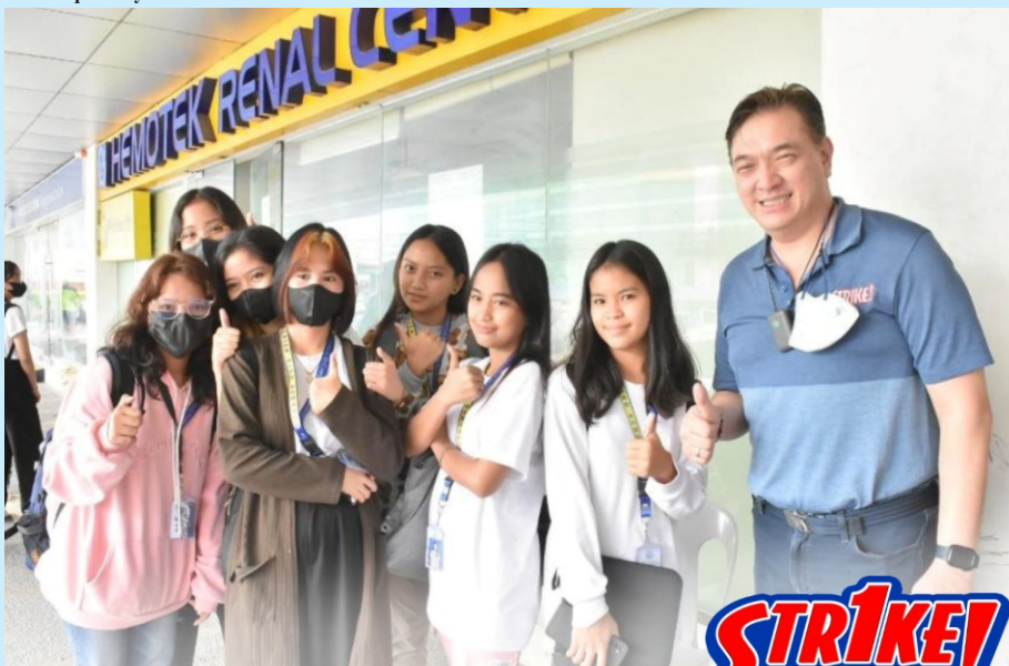
Kumusta po, mga kababayan? Busy Thursday -- from meetings to wake visits to inspections and events. Pero sabi nga po, mapapagod pero 'di susuko. Basta't para sa ating mga kapwa Bacooreño. #StrikeSaSerbisyo