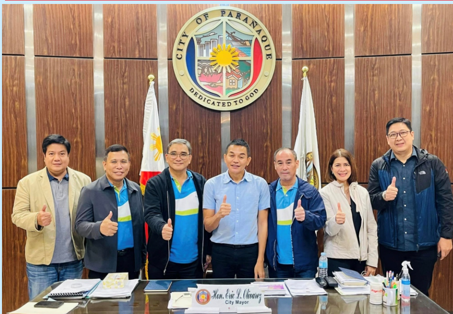
January 05, 2023 Visited by the Maynilad Officials headed by Sir Carlo Comsti, during the peoples day at Parañaque City Hall.