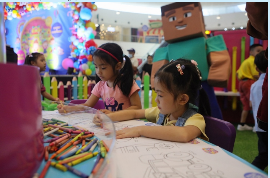
THE IMAGINATION STATION is for children who love art.