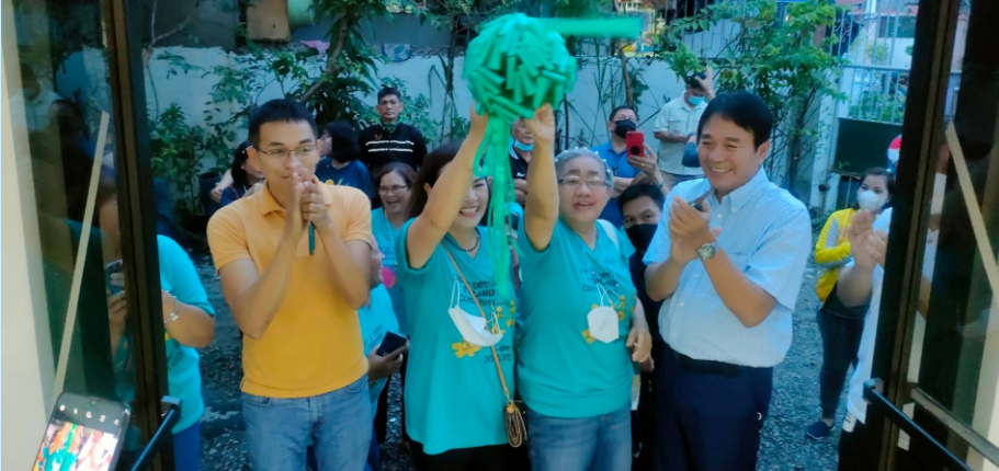
Inauguration Ceremony & Blessing of Topland Multi-Purpose Building Brgy.San Isidro.