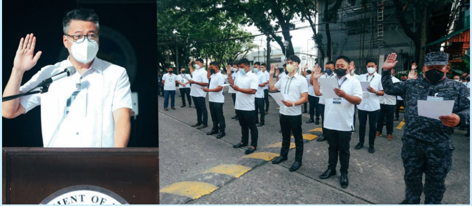
Commissioner Yogi Filemon L. Ruiz leads the oath taking activity of the newly appointed and promoted Bureau of Customs employees lastweek held at the Office of the Commissioner Grounds, Port Area, Manila.