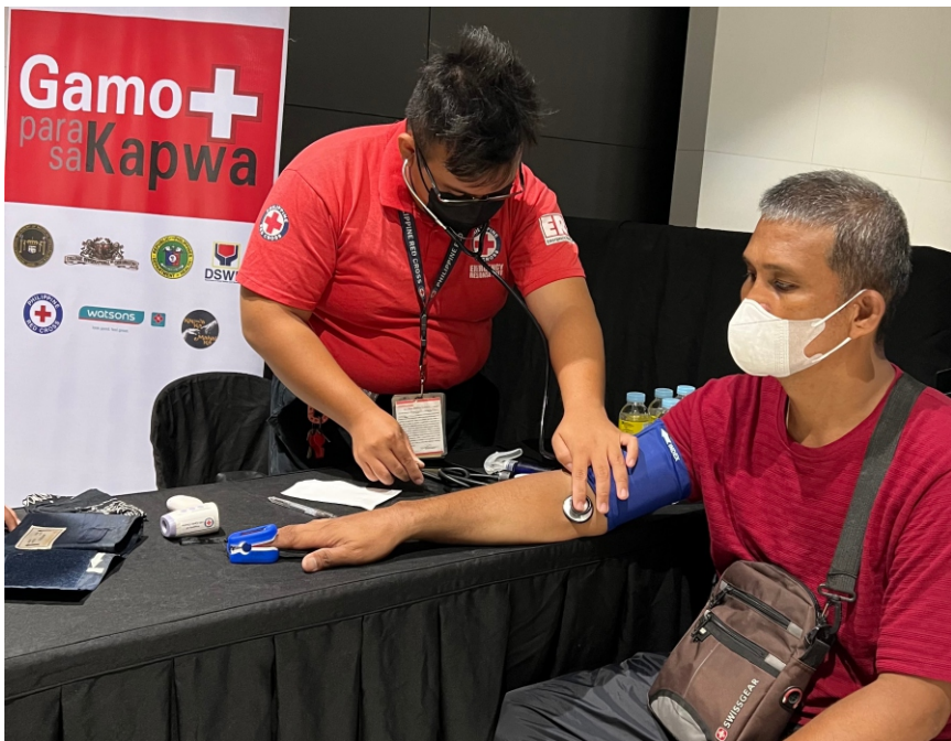
Red Cross volunteer conducts a blood pressure test on the patient.

Learn more about WalterMart's More to Love campaign at https://www.youtube.com/watch?v=7pPPI9GsOKA&ab_channel=WalterMartMall