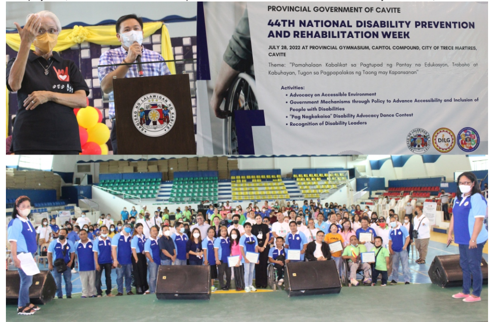
Provincial Gymnasium, Trece Martires City.

In empowering the differently-abled, the Provincial Persons with Disability Affairs Office and the Federation of Persons with Disabilities – Cavite Inc. (FPDCI) conducted a two-day celebration of the 44th National Disability Prevention and Rehabilitation week with the theme "Working with the Government in Achieving Equal Access to Education, Employment, and Livelihood towards Empowerment of Persons with Disabilities" on July 26 and 28, 2022 at the