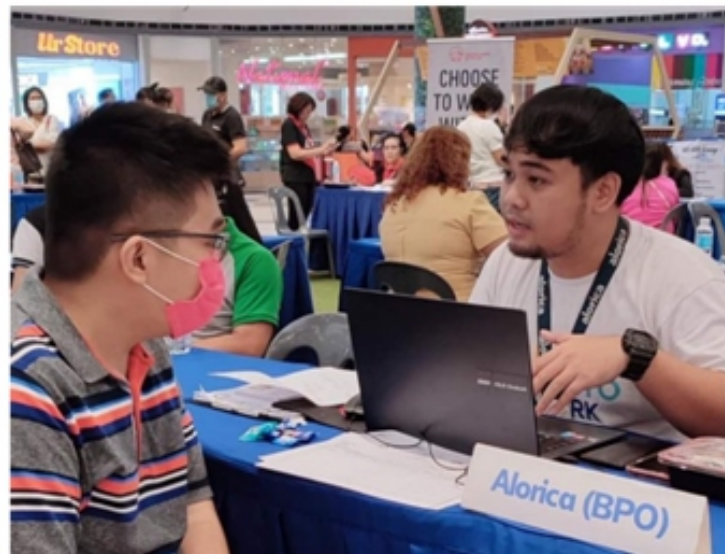
SM CENTER IMUS, CAVITE- SM Center Imus, in partnership with PESO and the City Government, recently held a one-day Job Matching Event at SM Center Imus Event Center. The event was attended by job seekers who are looking for the best opportunities matching their credentials and potentials. The job matching event was successful with the help of the participating companies such as Alorica, AIA Philippines, Pro-Tempo Promotions & Marketing Corporation, Vilmar Manpower Agency, Home Credit, Jac Liner, Euro-Med Laboratory, South Meats, Generation One Resources Recruitment, Waltermart, Oneimus Job Contracting Services, Emi-Yazak, S&R Imus, Our Lady of the Pillar Medical Center, Maxicare, The Binondo Food Group, Optimized Customer Solutions, Inc., SM Appliance Center, Shopping Center Management Corporation, Ace Hardware, Elite Jinzai, and People Serve.

Republic of the Philippines REGIONAL TRIAL COURT Fourth Judicial Region Branch 109, Carmona, Cavite 2nd Flr., Hall of Justice Bldg., Brgy. Maduya, Carmona, Cavite Email add: rtc2cac109@judiciary.gov.ph; Tel. No. (046) 4828527