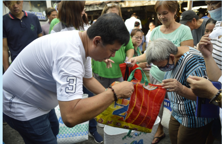
Namahagi po tayo ng 200 bayong o basket para sa ating programang Balik Basket at Bayong para sa mga piling mamimili sa Imus Public Market. Layunin po nitong tulongan ang mga nagtitindang makasunod sa Ordinansa Bilang 2012-134 o pagbabawal sa paggamit ng mga sando bags o anumang plastic sa dry goods na kanilang mga ipinagbibili. Isa lamang po ito sa mga paraan upang mahikayat natin ang ating mga kababayan na magdala ng sarili nilang mga bayong sa pamimili at maiwasan ang paggamit ng plastic na nakasisira sa ating kalikasan. #EarthDay2023 #AAngatAngImus #AlagangAdvincula