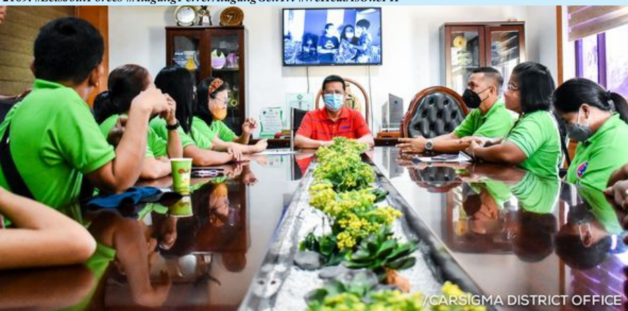
Maraming salamat sa pagbibigay ng oras, Federation of Differently Aabled Persons - GMA. Tinalakay namin ang mga proyekto at programa na maaari naming maihatid sa kanila upang matugunan ang kanilang mga pangangailangan. Naniniwala tayo na ang lahat ay dapat magbigayan ng respeto sa bawat isa kahit tayo ay magkakaiba. Lahat pantay-pantay. #AmaNgCarSiGMA #19thCongress #PeoplesDayFriday