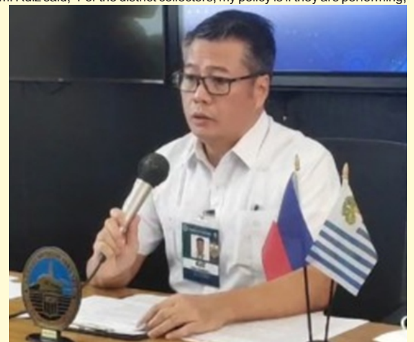
Commissioner Yogi Filemon L. Ruiz in weekly Press Conference.

Com. Ruiz added, "It's been lowered considering the present situation not only in the local but it international scene. The situation in Ukraine, high prices of oil products, it is affecting us right now." Com. Yogi Ruiz, is optimistic that the bureau will be able to surpass annual target collection for 2022. There are [17] ports in BOC, but [15] districts ports hit their respective monthly target collection.