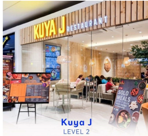
Kuya J LEVEL 2