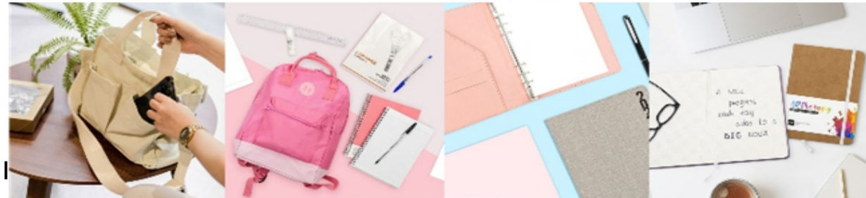
Metallic pink Casio calculator puts the glam in numbers. All in one school backpack for only Php 299. Minimalist Paper Source A5 and A6 planners to keep your schedule on track. Artherapy dotted notebooks will help you keep your goals on the dot.