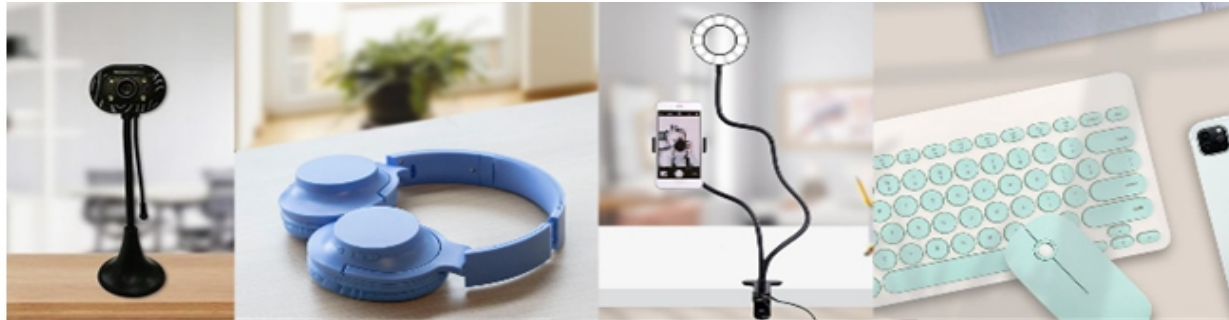
Stay selfie ready with this webcam with stand. Bluetooth headset for your online lectures. Selfie ring light with lazy pod available at SM Stationery. A pastel-colored mouse and keyboard combo for your online class set up.

lessons and schedules. Keep your kids creative with writing pads pens, as well as sketchpads for budding artists. Fun and fashionable backpacks, totes, and carry-all bags will help keep their things organized as they head off for school. All these and more are available at SM Stationery located in all The SM Store branches nationwide. For a more convenient shopping experience, check out https://smstationery.com.ph/ or ShopSM. Follow @smstationeryph on Facebook and @smstationeryph on Instagram for more exclusive deals and updates!