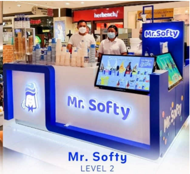
Mr. Softy LEVEL 2

WHAT'S NEW AT LEVEL TWO? SM CITY BACOOR, CAVITE – What's new at level two? Two of what you've always missed and craved for! SM City Bacoor brings you a taste like home in a homy dining experience with Kuya J's great Filipino gastronomic delights, and Mr.Softy's smooth and creamy soft-served ice cream. Bring your family for a sumptuous lunch or dinner at Kuya J Restaurant and enjoy their savory Filipino dishes everyone loves! Got kids in the family? Treat them with Mr.Softy's soft-serve iced cream for a little sugar rush and happy smile! Head now with your family and kids at the 2nd Level of SM City Bacoor and enjoy these.