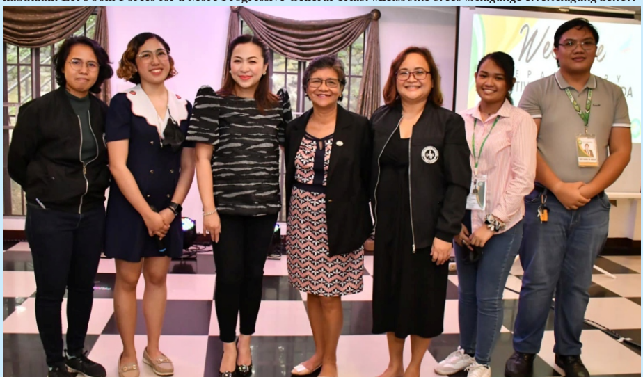
The City of Dasmariñas represented by its office/unit heads has embarked on a two-day Preparatory Executive-Legislative Agenda for the next three-year term at the Retreat & Conference Center of DLSU-Dasmariñas.