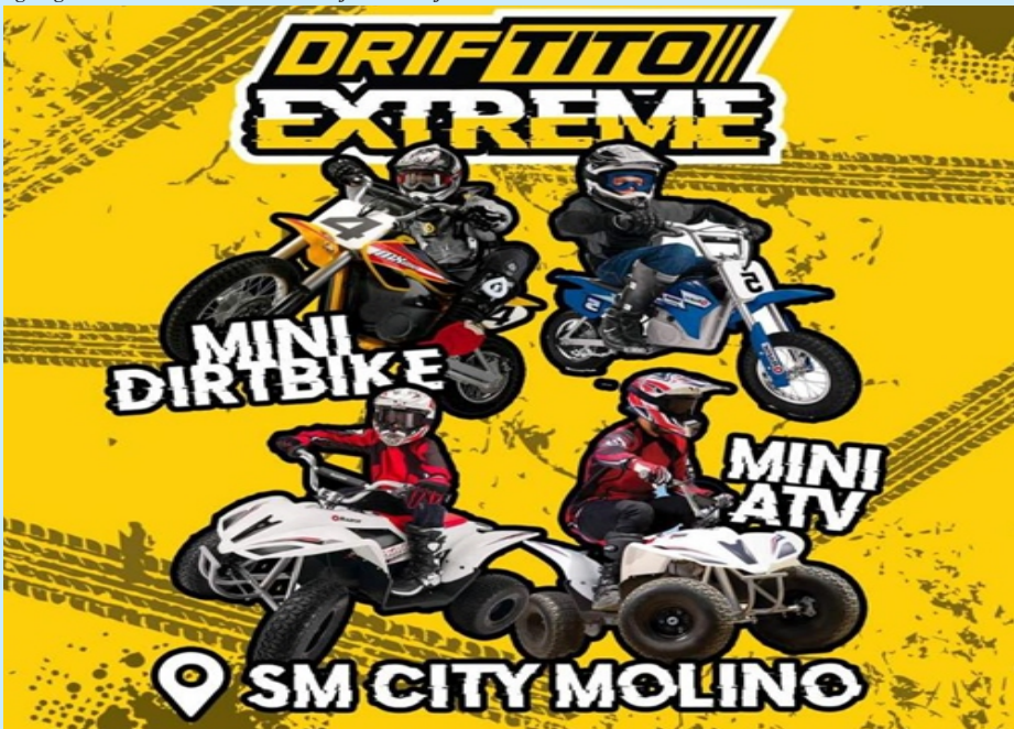
GO DRIFTITO EXTREME AT SM CITY MOLINO, CAVITE - HEY, LET'S DRIFT!Try the newest off-road adventure here at Color Drift located at SM City Molino Roofdeck! Make your weekend more extreme with Driftito Extreme's Electric Mini ATV and Mini Dirt Bike! No License required for all these fun driving sessions! Visit Color drift at SM City Molino Roofdeckevery weekdays from 2pm-9pm and 12nn-9pm every weekends and holidays. Enjoy!