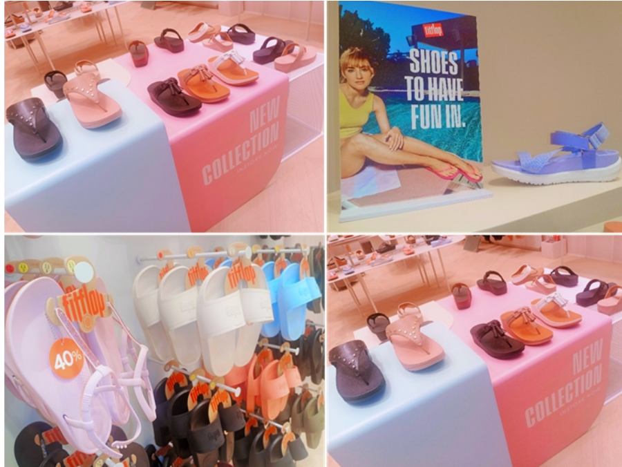
GET THE LATEST COLLECTIONOF FITFLOP AT SM CITY BACOOR, CAVITE –Stylish and lightweight, can your footwear be any better that what Fitflop has to offer? Choose from a wide range of chic and durable sandals, shoes, and slippers at Fitflop – SM City Bacoor! You'll surely love their newest collection and more, with some items up to 40% off and great deals in 20% off when you buy two pairs! So go ahead and see what fits your everyday look at Fitflop located at the Upper Ground Floor of SM City Bacoor.

SMCITY MOLINO A PAWSOME DAY AT SM CITY MOLINO, CAVITE – You're always welcome here to have a pawsome day with your family and pets! It'salways a fun time with fur parents and their fur babies at SM City Molino! Pets enjoyed their treats and freebies plus they got a chance to get free microchips! A bunch of lovely pawfriends arealso looking for new fur parents from Tails of Freedom Animal Haven and Sweet Pets Haven. See you in the next fur date at SM City Molino!