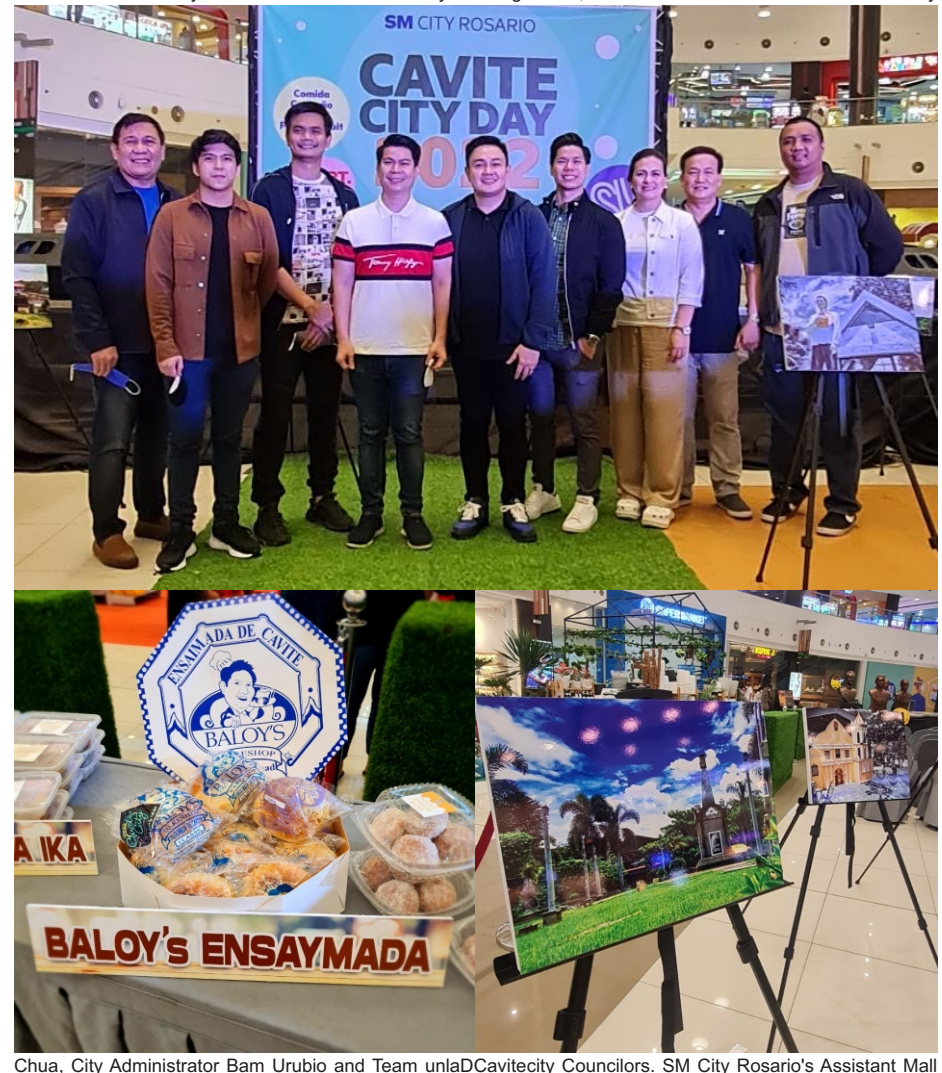
Manager Ryan James Pal was also prese nt to welcome the guests The Cavite City day food and photo exhibit is from September 3 until September 9 at the event center of SM City Rosario

he City of Cavite celebrates its Cavite Day at SM City Rosario, showcasing the city's sumptuous delicacies and rich culture through a food exhibit called Comida (chabacano term means food)Caviteño and a photo exhibit. The exhibit opening was graced by the presence of the local government of Cavite City headed by Honorable Mayor Denver Chua with Vice Mayor Raleigh Rusit, Board Member of Cavite 1st District Davey