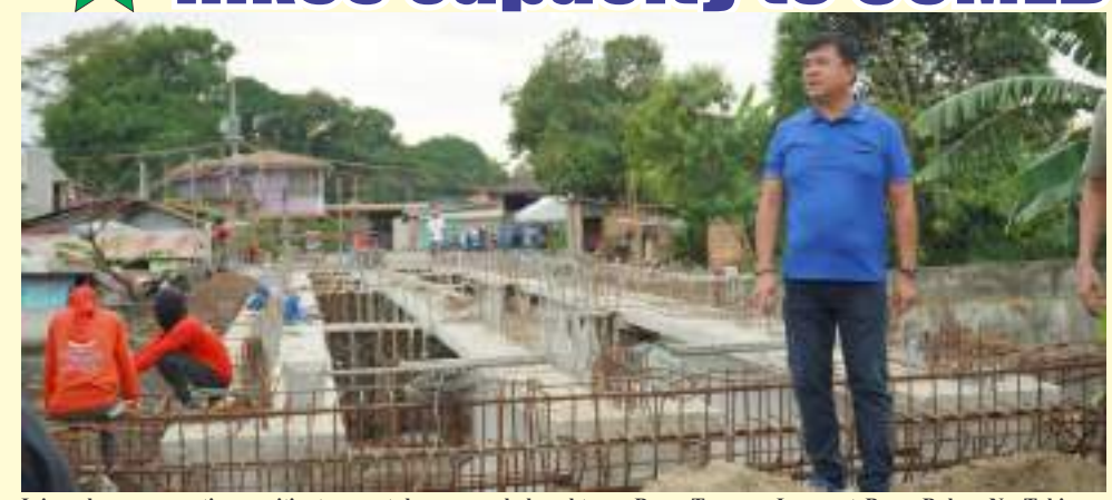
Ininspeksyon po natin ang itinatayong tulay na nagkokonekta sa Brgy. Tanzang Luma at Brgy. Buhay Na Tubig na magbibigay solusyon sa iniindang trapiko ng ating mga kababayan sa parteng ito. Sa sama-sama nating pagkakaisa at pagkakaroon ng iisang layunin, makakamtan natin ang mga magagandang plano para sa ating lungsod at mga Imuseño! #AAngatAngImus #AlagangAdvincula