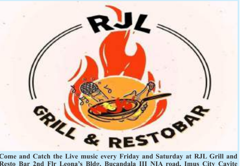
Come and Catch the Live music every Friday and Saturday at RJL Grill and Resto Bar 2nd Flr Leona's Bldg. Bucandala III NIA road, Imus City Cavite (Beside Puregold Bucandala)