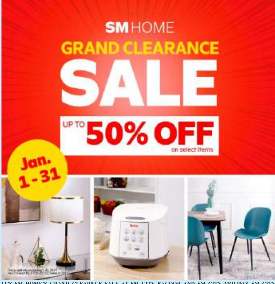
IT'S SM HOME'S GRAND CLEARNCE SALE AT SM CITY BACOOR AND SM CITY MOLINO! SM CITY BACOOR, SM CITY MOLINO, CAVITE - This is your sign to refresh your home for a great start this 2024! Grab your home essentials at the SM HOME GRAND CLEARANCE SALE from January 1 to 31, 2024. Get up to 50% OFF on select linens, furniture, kitchenware, tableware, storage, and décor! Head now at SM Home at SM City Bacoor and SM City Molino to find great deals and exquisite home essentials. We've Got It All For Your Home at #SMHome!