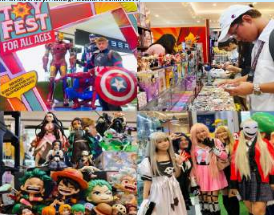
TOY FESTIVAL AT SM CITY TRECE MARTIRES: Toy enthusiasts and cosplayers gathered at SM City Trece Martires for the Toy Fest for all ages on December 25 to 30, 2023. Favorite collectibles from various animes, cartoons, and superheroes were displayed and exhibited while South Cosplayers showcased their cosplay and runway skills here at SM City Trece Martires!