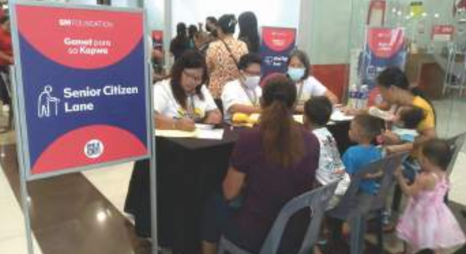
Around 500 residents of Rosario, Cavite received free medical services such as blood test, ECG, consultation, free medicines and dental services from the recently concluded medical mission of SM Foundation's Gamot para saKapwa project at SM City Rosario.

September 6 - 12, 2023 Vol. XIII: No. 8 P10 CIRCULATED NATIONWIDE