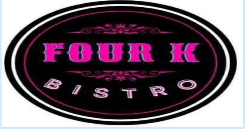
Opens Tuesday-Sunday (6pm-3am) located at 2nd Flr Leona's Bldg. Bucandala III NIA Road Imus City Cavite (Beside Puregold Bucandala)