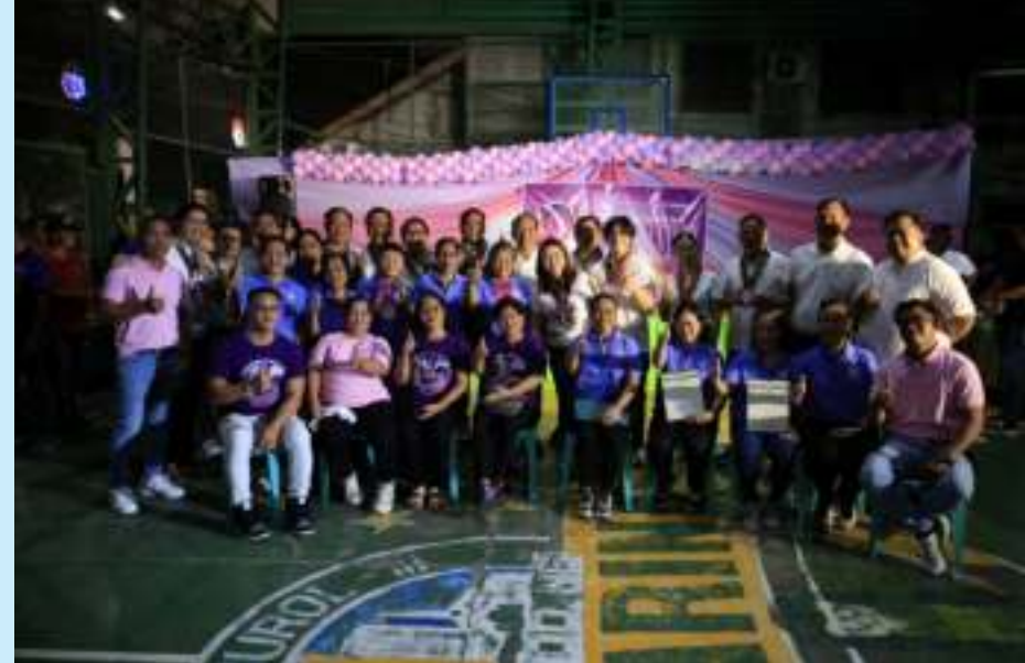
Oathtaking Ceremony of Kababaihan ng Barangay Burol 3

TINGNAN: OPENING NG PALARONG PANLUNGSOD 2024: Ngayong araw, Oktubre 12, ay ating nakasama ang mga kabataang manlalaro mula sa ating mga pampublikong elementarya sa City of Carmona na magtutunggali sa iba't-ibang larangan ng sports sa ating Palarong Panlungsod 2024. Best of luck po sa lahat ng mga kalahok at hangad ko po ang masigla at masaya ninyong palaro. Ngayon pa man ay congratulations na po sa lahat ng mga Kabataang Carmona na kalahok! #CityOfCarmona #LungsodNgCarmona #LGUCarmona #BayanMunaLagi #DapatAngatLahat