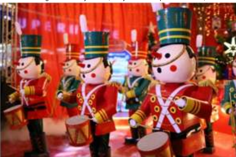
Bringing the beat of Christmas are these toy drummer boys coming to life.

The magic of the SM Supermalls Grand Magical Christmas Parade will continue across various SM Supermalls in year long wait. This much-anticipated event, a holiday favorite for shoppers, families and friends, brings a spectacular experience of vibrant colors, enchanting music, and the heartwarming magic of Christmas South Luzon, bringing joy to families all over the region and a chance to experience the warmth and wonder of Christmas. So mark your shoppers, families and friends, brings a spectacular experience of celebration continued from SM City Baccor to SM City Dasmariñas callendars and bring your loved ones for a celebration that's sure to be unforcettabled. The Grand Magical Christmas at SW City Dasmariñas. as the mall host its own Grand Magical ChristmasParade. be unforgettable! The Grand Magical Christmas Parade is more than Shoppers and their families weredelighted with a lively display as just an event; it's a joyful experience filled with magic, laughter, and these characters march through the mall, spreading joy and the the warmth of holiday togetherness. Don't miss out on this magical holiday celebration—it's Christmas, the SM Supermalls way!