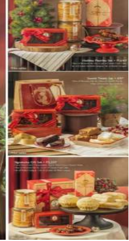
nost special time of the year. Visit Mary Grace at SM City Molino and check out these signature gift sets fo