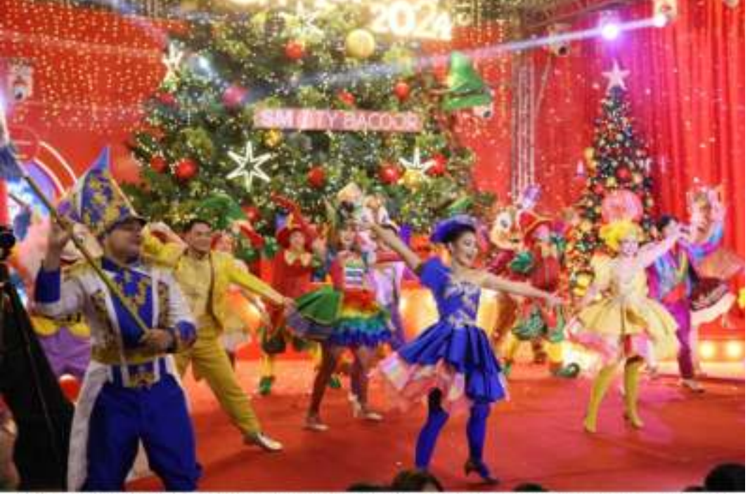
Vibrant Christmas characters and enchanting performances filled the air with joy and festive cheer with the highly anticipated SM Supermalls Grand Magical Christmas Parade at SM City Bacoar