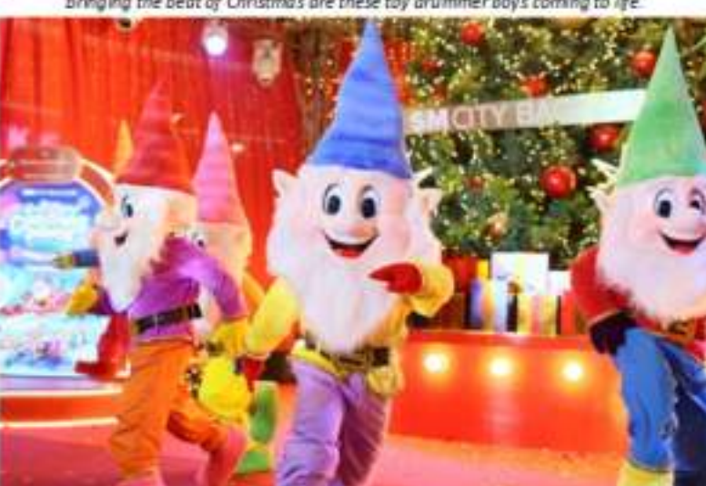
These joyful dwarves added fun and excitement to the kids during their performance.