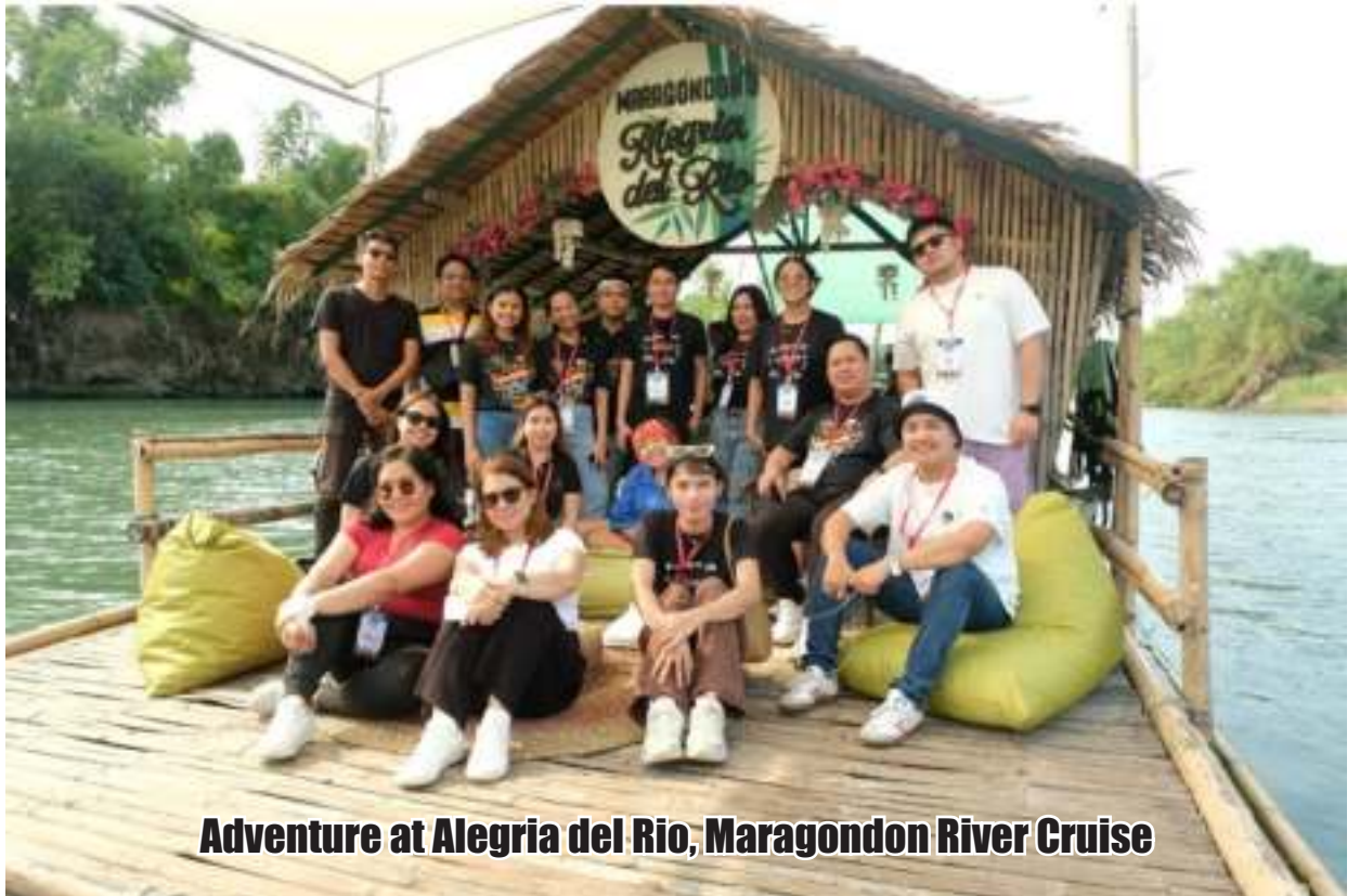
Adventure at Alegria del Rio, Maragondon River Cruise