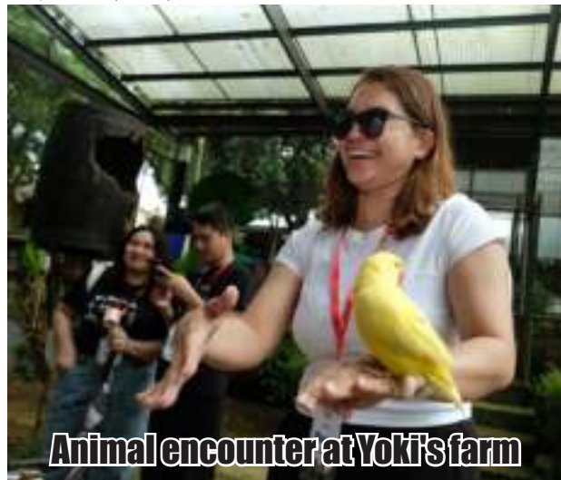
Animal encounter at Yoki's farm