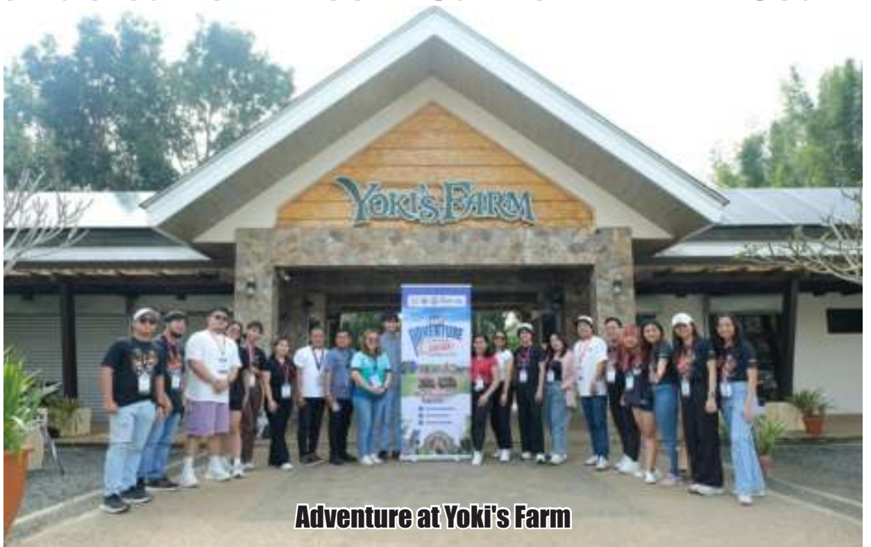
Adventure at Yoki's Farm

MPT South is a subsidiary of Metro Pacific Tollways Corporation (MPTC), the infrastructure arm of Metro Pacific Investments Corporation (MPIC).