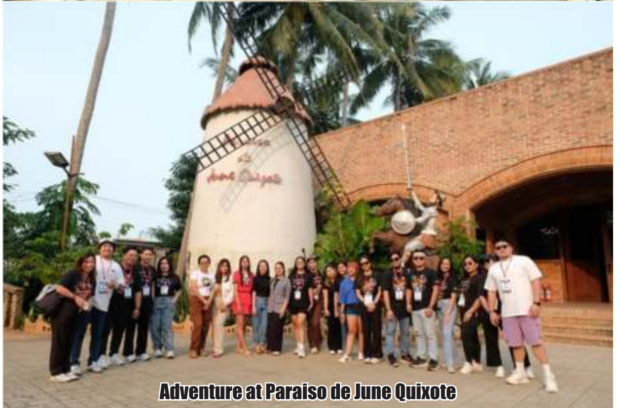
Adventure at Paraiso de June Quixote