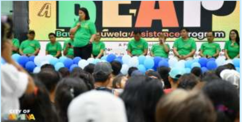
BAWAT ESKUWELA ASSISTANCE PROGRAM PARA SA MGA DAYCARE PUPILS AT PDAO LEARNERS: Isinagawa sa CarSIGMA Gymnasium kahapon, Marso 27, ang pamamahagi ng educational assistance para mga Daycare Pupils ng ating Child Development Centers at PDAO Learners mula sa Bawat Eskuwela Assistance Program. Nagsagawa rin ng pamamahagi sa Paligawan Matanda at Bancal para sa mga Daycare pupils nito. Ang programang ito ay naglalayong maghatid ng tulong sa mga mag-aaral para mapabuti pa ang kanilang pag-aaral. Patuloy nating isusulong ang mga programa na gaya nito para sa mga mag-aaral at sa sektor ng edukasyon. #BEAP #BawatEskuwelaAssistanceProgram #CityOfCarmona #LungsodNgCarmona #LGUCarmona #BayanMunaLagi #DapatAngatLahat