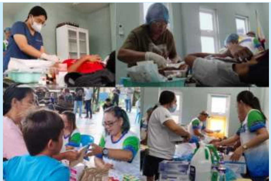
Operation Tuli Program Transforms 81 Young Boys in Tanza. A successful Operation tuli program was conducted in Brgy. Santol, Tanza, Cavite, benefiting a total of 81 young Tanzanians from Brgys. Bunga, Santol and Bucal. This initiative, a collaboration between the medical practitioner from RHU-Tanza and the Office of the Provincial Health Officer, marked a significant step in transforming these boys to manhood. The event's success was credited to the concerted efforts of local officials, Office of the Provincial Governor and dedicated medical professionals. Their commitment to community health and development was evident as they worked tirelessly to achieve their mission. (OPIO)