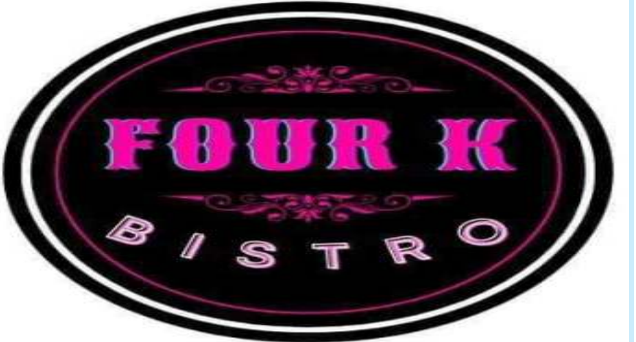
Opens Tuesday-Sunday (6pm-3am) located at 2nd Flr Leona's Bldg. Bucandala III NIA Road Imus City Cavite (Beside Puregold Bucandala)