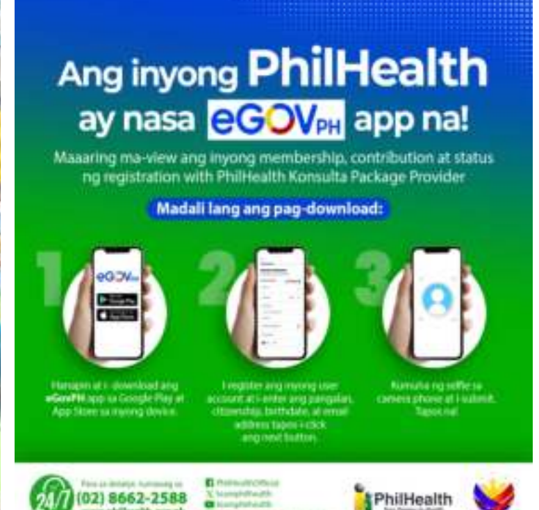
Simplify your PhilHealth transactions with eGovPH app. Download now! #MyPhilHealth #SagotKaNgPhilHealth