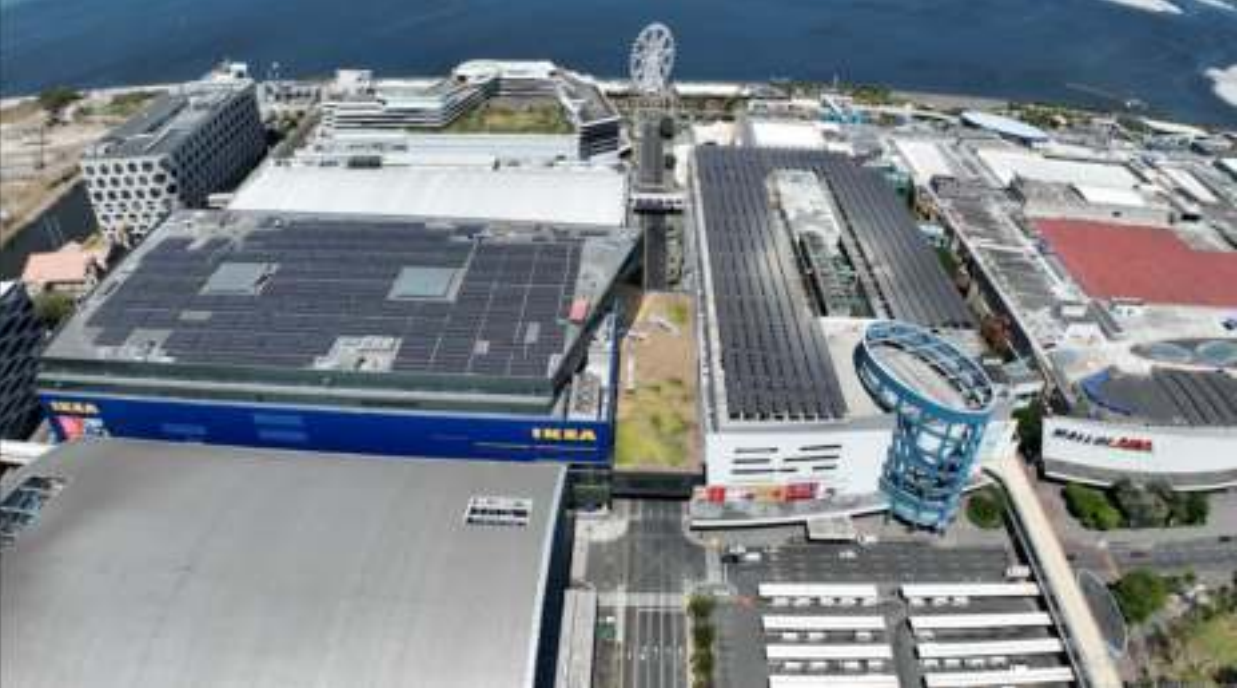
More than 3,600 solar panels were installed on the roof of MOA Square in the Mall of Asia Complex

In 2022, SM Prime secured a long-term deal with AboitizPower for its clean energy supply. Under the agreement, AboitizPower will provide reliable and responsibly-sourced energy