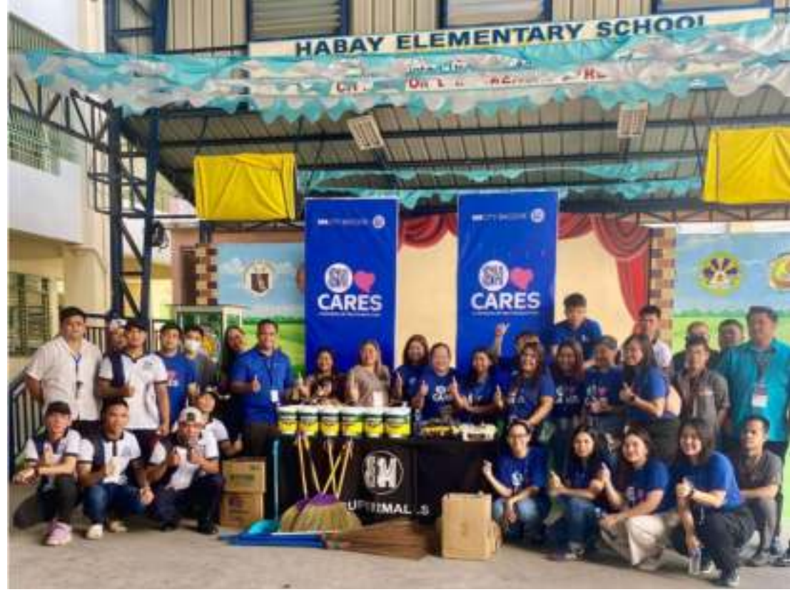
Strengthening the community and aiding for growth, SM City Bacoor recently extended its support to Habay Elementary School by participating in the annual BrigadaEskwela initiative. Mall employeesand security personnelvolunteered to clean the school grounds, ensuring a safe and welcoming environment for the students. In addition to their hands-on efforts, SM City Bacoor generously donated cleaning supplies and painting materials, which will help the school maintain its facilities throughout the school year. This collaboration highlights SM City Bac or's commitment to fostering co