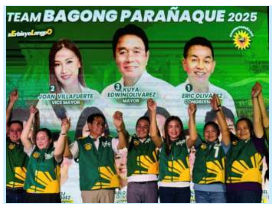
April 16, 2025 Day 20 Team New Parañaque campaign rally at Tata Kulas, Barangay La Huerta. #yoursinpublicsERvICe