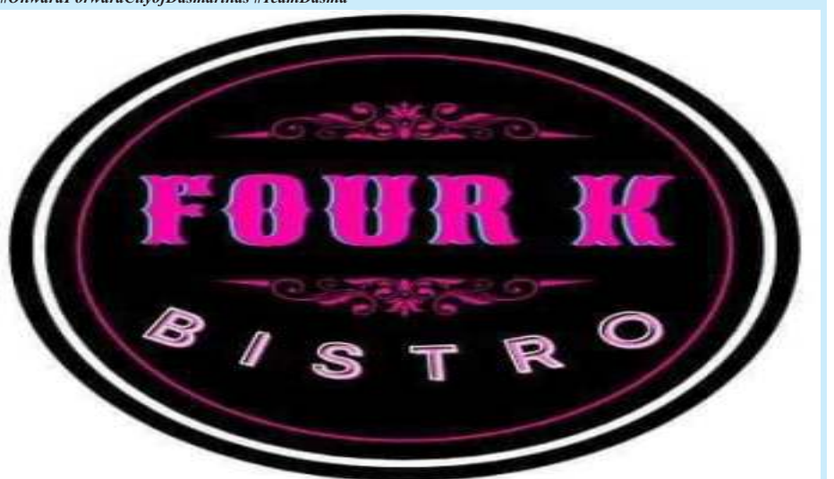
Opens Tuesday-Sunday (6pm-3am) located at 2nd Flr Leona's Bldg. Bucandala III NIA Road Imus City Cavite (Beside Puregold Bucandala)