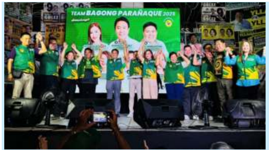
April 26, 2025 Day 30 Team New Parañaque campaign rally at Lopena-Sunrise, Fourth Estate, Barangay San Antonio. #yoursinpublicsERvICe