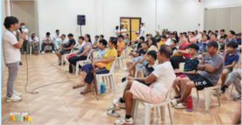
OPERATION MANHOOD 2025 NG CHO CARMONA: The Office of the City Health Officer conducted Operation Manhood 2025 or Free Circumcision for the second time for 208 young men, ages 10 and above, from the City of Carmona. The circumcised also received free medicine from the City Government of Carmona. Such activity is part of our steps to deliver free medical services to the citizens of the City. #OperationManhood2025 #OperationManhood #Libreng Tuli #CityOfCarmona #LungsodNgCarmona #LGUCarmona