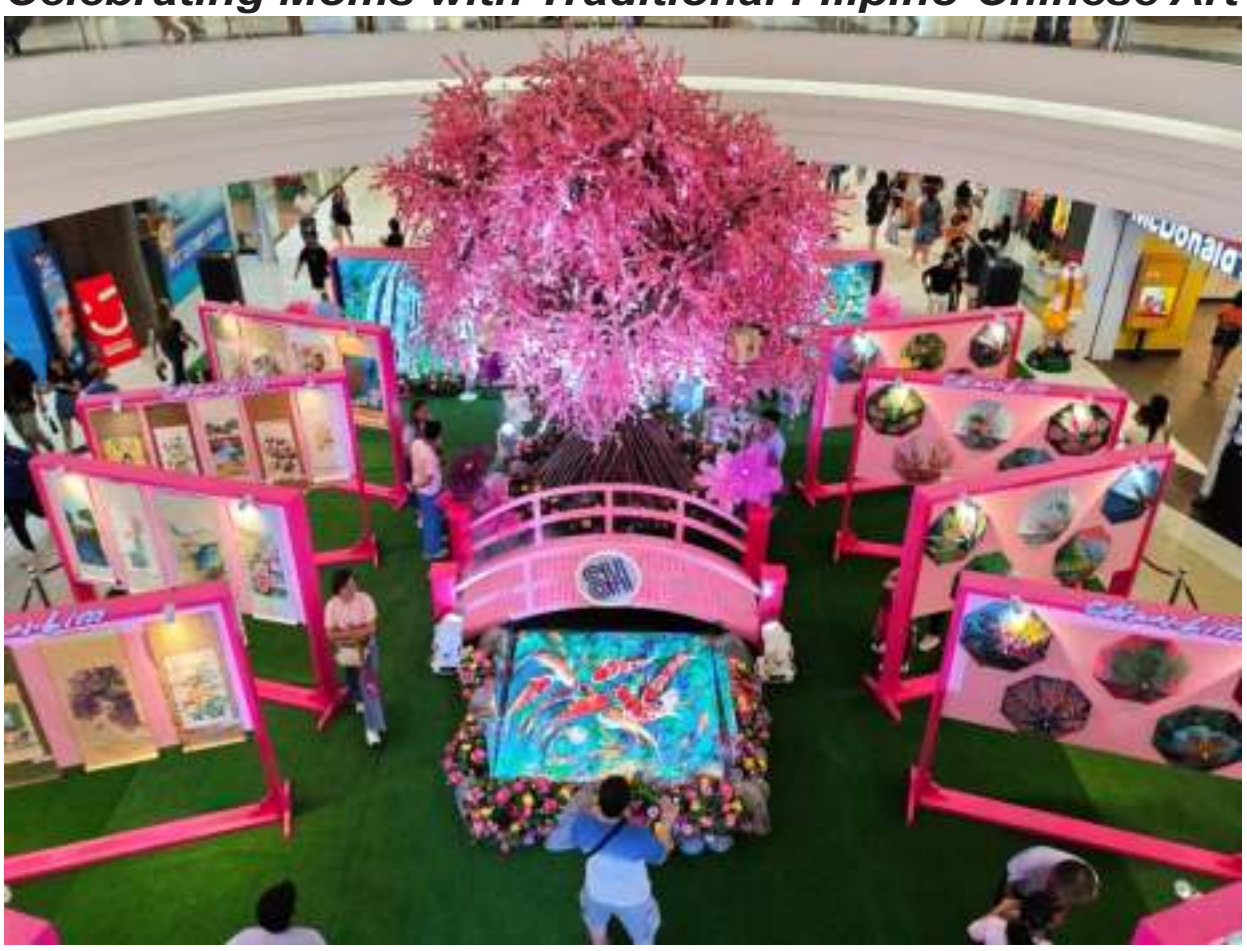
Experience love blossoming at SM City Bacoor as you immerse yourself in the rich cultural Filipino-Chinese art tradition featured in Chan Lim's 52nd Exhibit - Blossoms of Love for Moms