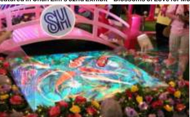
Traditional art comes to life as AI transforms this painting into a life-size koi pond projection

M City Bacoor proudly presents the 52nd showcase of the extraordinary exhibit, running from April 27 to May 13, 2025, celebrates the blossoming love of moms through a fusion of timeless art and cutting-edge technology.