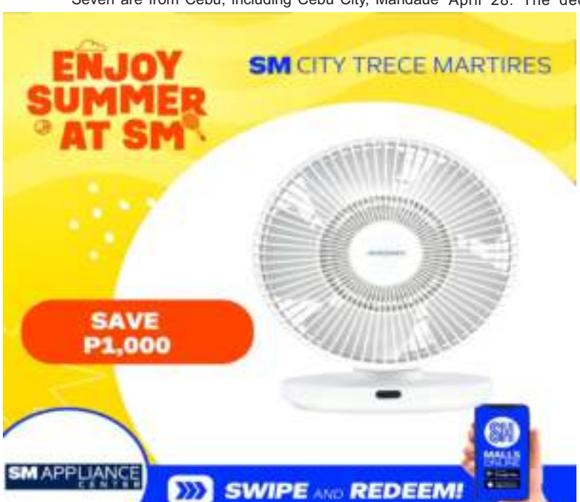
et the SUMMER FUN BEGIN! Level up your summer with SM Deals at SM Appliance center. Download the SM Malls Online app and get more deals this summer.