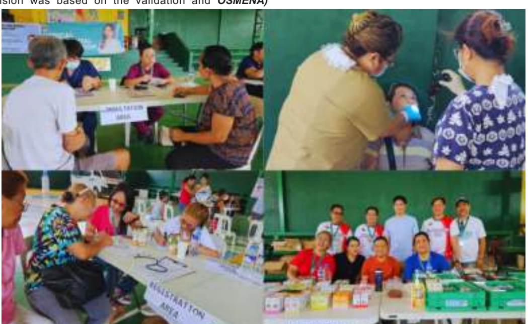
On April 29, 2025, the medical mission team headed by the Office of the Provincial Governor (OPG) and the Office of the Provincial Health Officer (OPHO) conducted a health outreach program at Brgy. Paliparan I, City of Dasmariñas. The program aimed at providing free consultation and medicine to the community. The health program was successfully carried out with the support of medical and dental professionals from the OPHO, whose expertise and dedication enabled the provision of free consultations and medicines to 170 medical and dental patients. (OPIO)