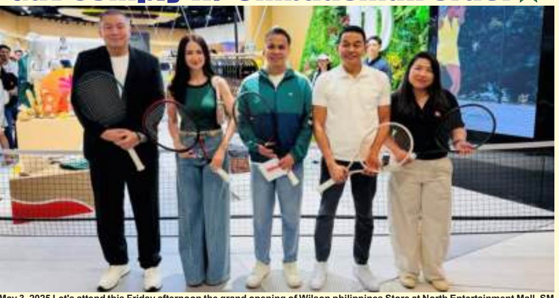
event. Again, thank you very much and congratulations! #YoursInPublicsERvICe

but you cannot choose the consequences cnoose vour sin