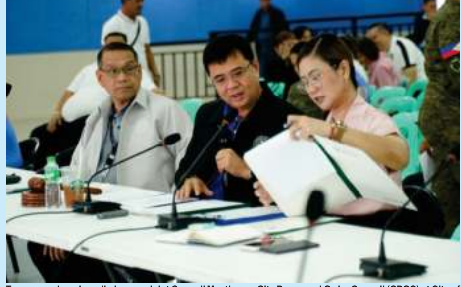
Tayo po ay dumalo sa ikalawang Joint Council Meeting ng City Peace and Order Council (CPOC) at City of Imus Anti-Drug Abuse Council (CIADAC) upang talakayin ang mga kasalukuyang isyu at hakbang para mapanatili ang kaayusan, kapayapaan, at kaligtasan sa ating lungsod. Patuloy ang ating pakikiisa sa mga programa kontra kriminalidad at ilegal na droga, katuwang ang iba't ibang ahensya ng pamahalaan at mga miyembro ng komunidad. Layon nating masiguro na ang Imus ay ligtas, disiplinado, at maayos para sa bawat Imuseño. #AAngatAngImus #AlagangAdvincula