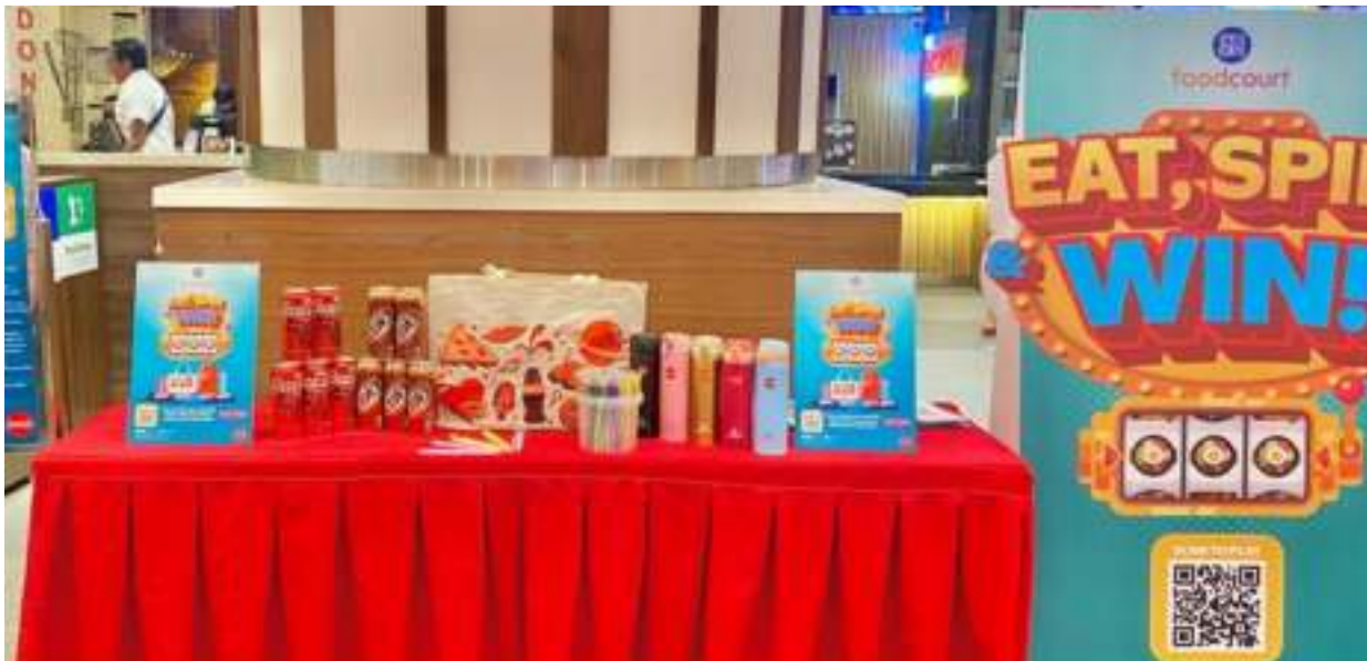
With a purchase of at least P299 that includes any Coca-Cola product, get the chance to win fun prizes at SM Foodcourt!