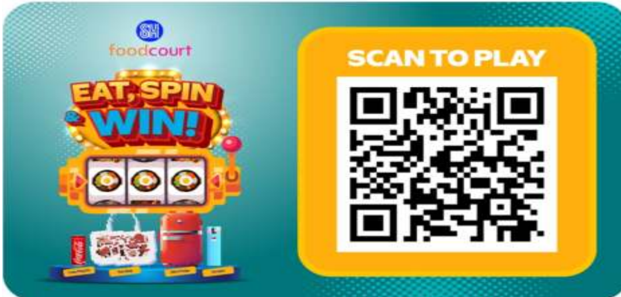
Keep an eye out for the Eat, Spin, & Win QR codes posted around select SM Foodcourts nationwide.