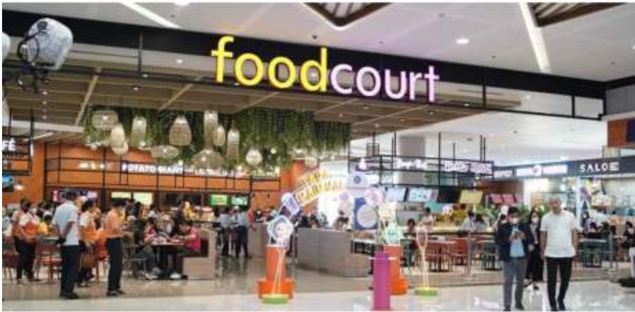
Find a flavor for every craving at SM Foodcourt, with culinary offerings that range from local comforts to international fares.

Calling all foodies who love fun and prizes! Visit the Foodcourt at select SM malls to join the Eat, Spin & Win promo. Running from July 20 to August 20, 2024, this period promises to make your dining experience at SM Foodcourt even more enjoyable.