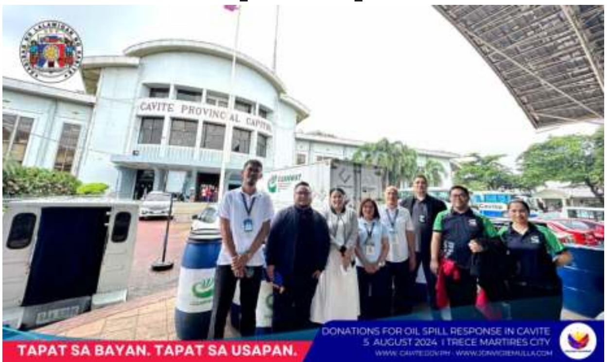
PGC officials expressed their deep gratitude for these neighboring local government units underscores the collaborative donations. The timely support from both the private sector and approach needed to tackle such crises.