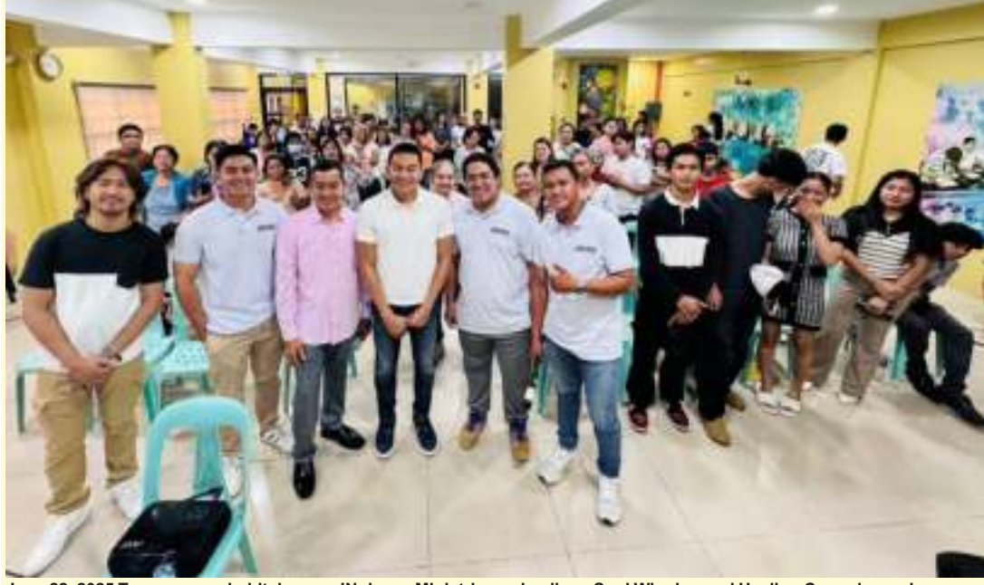
June 22, 2025 Tayo po ay naimbitahan ng JNolasco Ministries sa kanilang Soul Winning and Healing Crusade na ginanap sa San Dionisio Credit Coop Satellite sa Barangay San Isidro.

Cebu City's Vendors pushes for livelihood protection, preserve historic landmark DOLLE-7 Cap Brays to ald Decurpational Safety