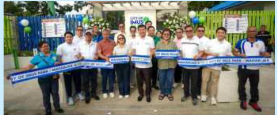
CITY OF IMUS PARK - MAHARLIKA: Inaanyayahan ko po ang bawat pamilyang Imuseño na mamasyal at mag-bonding sa bagong bukas na City of Imus Park Maharlika. Ito po ay LIBRE at bukas para sa lahat, bata man o matanda ay tiyak na mag-eejoy. Narito ang mga maaari ninyong ma-experience: • Pet Friendly • Kiddie Slides • Swing • Sea-Saw • Animal Rockers • Pavilion • Benches and Tables • Grass Carpet Area • Outdoor Fitness Equipment • Outdoor Gym Cycle • Bike Parking Area • Clean Comfort Room Bukas po ang parke araw-araw mula 6:00 AM hanggang 8:00 PM na matatagpuan sa Belarmino, Barangay Maharlika. Patuloy po nating pangalagaan ang kalinisan at kaayusan ng ating parke upang mas marami pang Imuseño ang makinabang. Tara na at pumasyal sa City of Imus Park Maharlika! #CityOfImusParkMaharlika #LungsodNgImus

Vol. XV: No. 33 P10 CIRCULATED NATIONWIDE Feb. 25 - Mar. 3, 2026