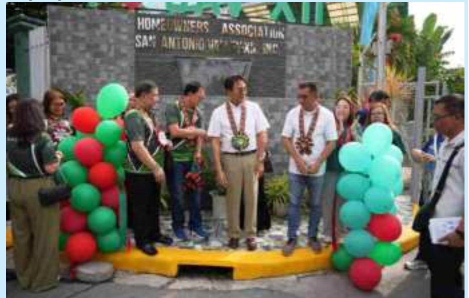
Inauguration and Oath Taking Ceremony! Tayo po naging saksi sa ginawang Oath Taking Ceremony ng 2026 Newly Elected Board of Directors at Officers ng Homeowner's Association San Antonio Valley XII Inc. kanina. Kasunod po nito ang pagbubukas ng SAV XII Landmark at ang bagong pinturang covered court. Bukod sa sports activities, magsisilbing rin bilang venue ang covered para sa ibang pagtitipon sa San Antonio Valley. Congratulations sa ating mga bagong halal na mga opisyal! Nawa'y patuloy ninyong mapagtibay at lalong mapalakas ang pagkakaisa sa pagtataguyod ng kaunlaran ng ating mga komunidad. #SaDiyosSaTaoSerbisyongTotoo #sErbisyoLangPO #BagongParañaque