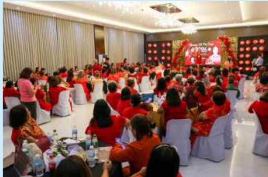
Gong Xi Fa Cai 2026! Chinese New Year celebration of KDBM held at Mi Chateau. #SulongNaSulongPaDasmariñas #OnwardForwardCityofDasmariñas