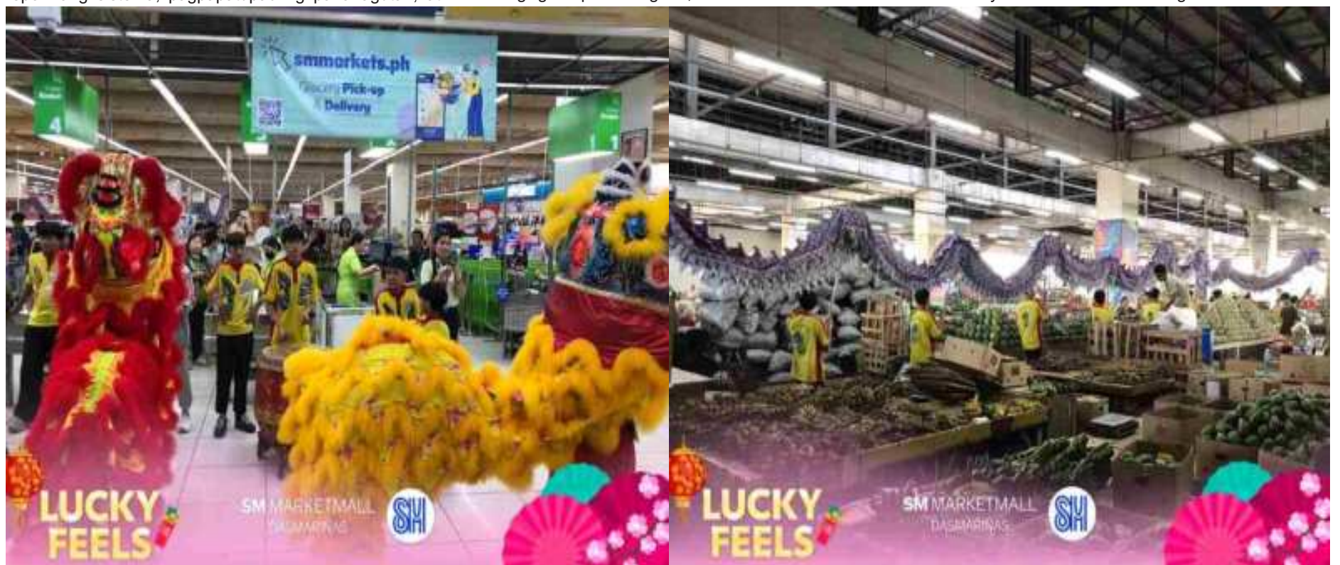
SM Marketmall Dasmariñas went all out in celebrating Chinese New Year, welcoming shoppers with a festive lion and dance performance. Truly a gala to the max moments at one of Cavite's most loved community malls.