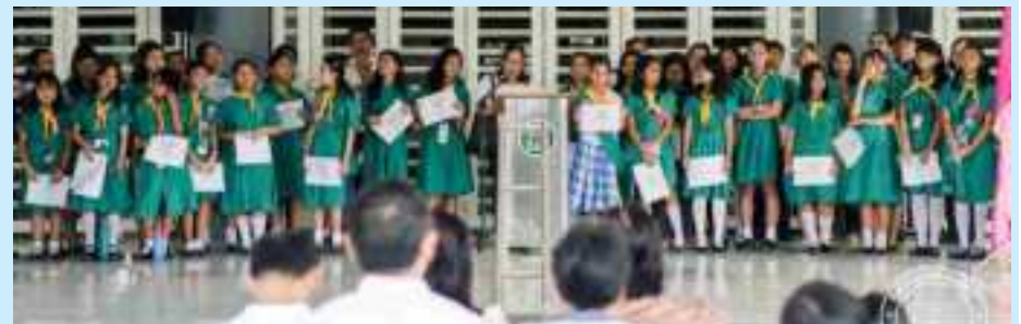
Beautiful Chant! A happy Monday to us all and a wonderful day as well to work harder in delivering services with Heart and Concern. We also congratulate the young Kawiteño who achieved honors in different fields. We are so proud of you and thank you so much for your honor that our town received! #RatedTripleA #PusoAtMalasakitParaSaAtingKawit