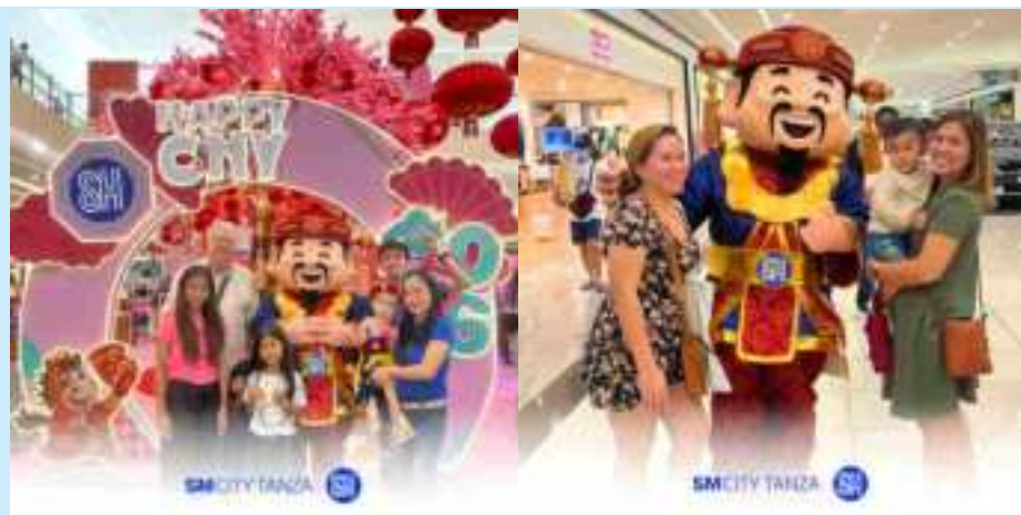
Prosperity and good fortune filled SM City Tanza as shoppers warmly welcomed the God of Wealth in a vibrant in-mall celebration. Smiles, cheers, and festive vibes to the max echoed throughout the mall as families and friends joined the special event. The celebration created memorable moments for the community, highlighted by lively interactions and photo-worthy scenes across the mall.