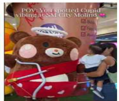
Shoppers enjoyed a maxed out Valentine's experience at SM City Bacoor, SM City Molino, SM City Rosario, and SM Center Imus — from romantic dates and sweet café moments to thoughtful gifts and fun family and barkada hangouts.