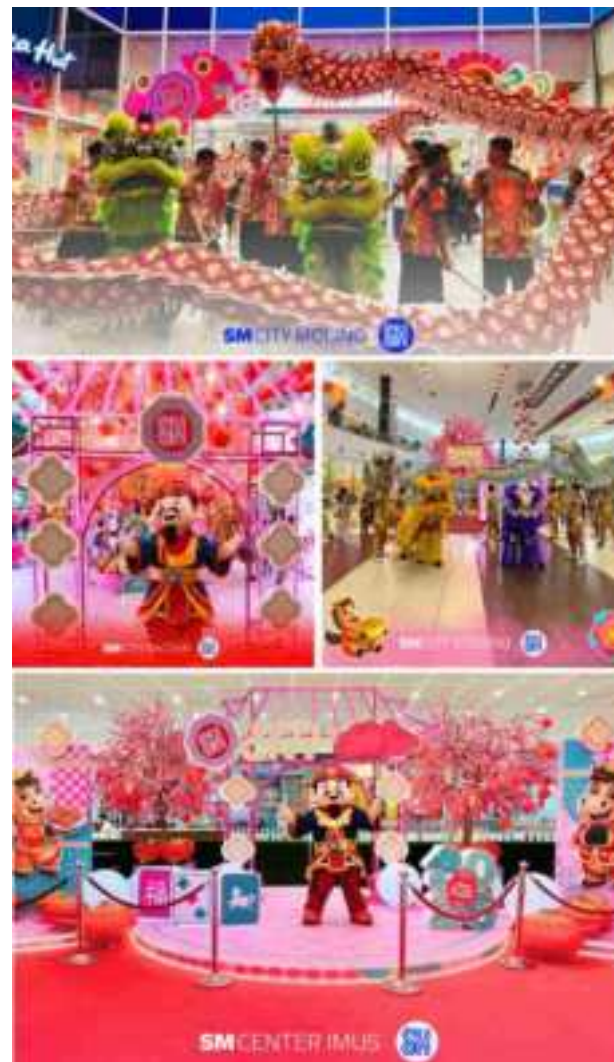
Smiles, snapshots, and so much good fortune! Our God of Wealth brought luck and happiness to everyone here at your most loved SM City Molino, SM City Bacoor, SM City Rosario, and SM Center Imus! Thank you for celebrating and sharing the festive spirit with us! Here's to a prosperous year ahead!

WATERFRONTNEWS: FEB. 18, 25 & MAR. 4, 2026