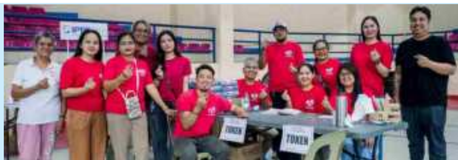
Ang dugo ng mga magiting, dugtong buhay sa nangangailangang chikiting: Maraming salamat sa mga kababayan nating nakikiisa at nagbahagi ng kanilang dugo sa Voluntary Mass Blood Donation Drive na pinangunahan ng Kawit RHU, at sa pakikipagtulungan natin sa Philippine Children's Medical Center. Malayo ang mararating ng ibinahagi ninyong dugo sa ating mga kababayan at kabataang nangangailangan. Maraming salamat po sa inyong Puso at Malasakit! #RatedTripleA #PusoAtMalasakitParaSaAtingKawit