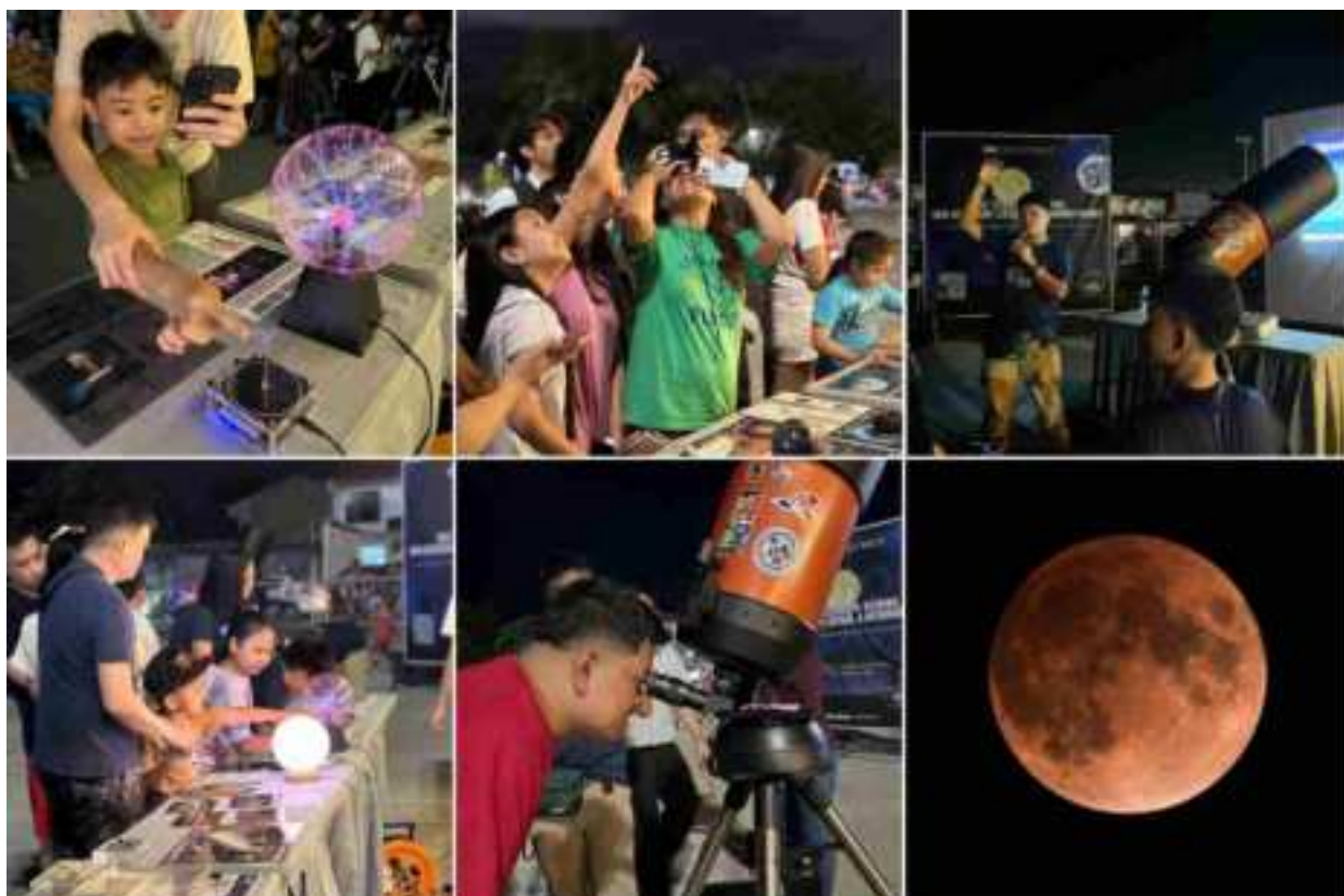
IMUS CAVITE - The night sky turned into a theater of celestial wonder as SM Center Imus hosted a successful community event for the recent Total Lunar Eclipse. Local residents and space enthusiasts gathered at the mall to witness the rare astronomical spectacle, watching in awe as the moon shifted into its iconic blood-red hue. The event was packed with educational opportunities, featuring interactive science displays that explored the mechanics of the solar system. To deepen the experience, experts conducted a series of short talks on moon observation, teaching attendees how to identify key lunar landmarks. The evening concluded with live sky-watching sessions, where families and hobbyists used provided equipment to get a closer look at the unfolding phenomenon.

Usaping DABAKARDS lalo na sa mga kalapit na tanggapan sa paligid ng Intramuros!! Mga Katoto, kung nais niyong masarap na Lutong Pinoy na tsibug. Mag- aliw at mag relax habang nakikinig ng live acoustic at folk songs mag tungo sa I-TOP VIEW CAFÉ & RESTAURANT 4th floor, Roof Deck Intramall Bldg. 706 Escuela st. Intamuros , Manila. Lets eat , enjoy, and relax.