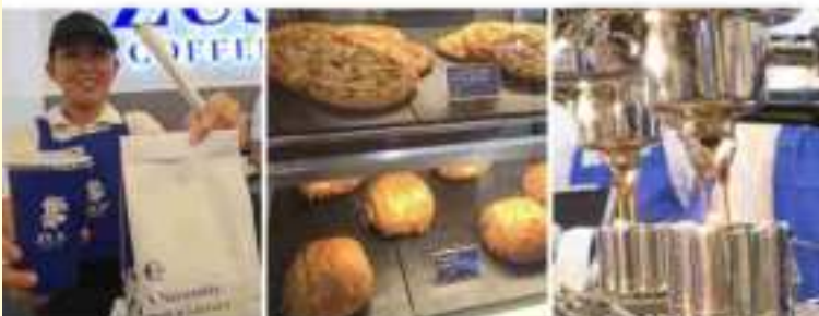
BACOOR, CAVITE - Coffee enthusiasts in Cavite have a new destination for high-quality brews as ZUS Coffee officially opens its doors on the 3rd Level of SM City Bacoor near the cinema. The branch invites mall-goers to experience a menu crafted with passion, featuring bold flavors designed for those who want to "go all out" with every cup. This latest addition to the mall's food scene provides a premium haven where local coffee lovers can "max out" on their favorite signature drinks.