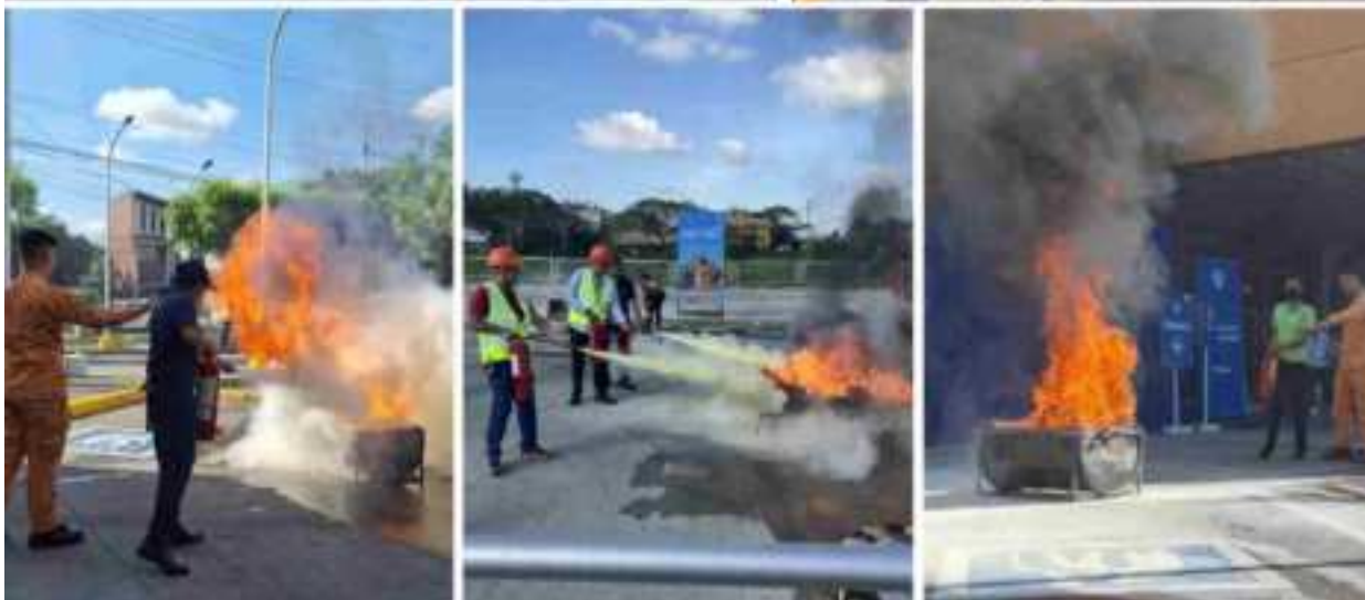
You Are Always Safe Here. As part of the Fifth Nationwide Fire Drill, National Simultaneous Earthquake Drill, and National Disaster Resilience Month, Bacoor, Rosario, and Imus BFP led fire safety demonstrations for employees during a drill at SM City Bacoor, SM City Molino, SM City Rosario, and SM Center Imus this Wednesday, March 3, 2026.