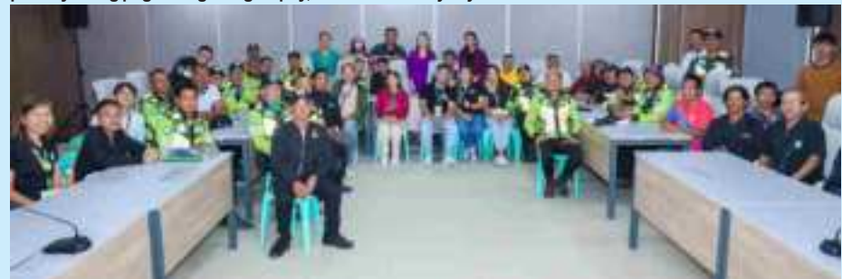
Courtesy Visit of ALS Students from different departments and offices of the City Government of Dasmariñas in preparation for their upcoming examination on March 29 together with DC ALS Coordinators and Instructors #SulongNaSulongPaDasmariñas #OnwardForwardCityofDasmariñas