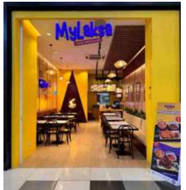
When the craving hits... Laksa it is! Drop by My Laksa and enjoy a rich, comforting bowl that will warm your foodie heart. Perfect for your next food trip at SM City Trece Martires!

Usaping DABAKARDS lalo na sa mga kalapit na tanggapan sa paligid ng Intramuros!! Mga Katoto, kung nais niyong masarap na Lutong Pinoy na tsibug. Mag- aliw at mag relax habang nakikinig ng live acoustic at folk songs mag tungo sa I-TOP VIEW CAFÉ & RESTAURANT 4th floor, Roof Deck Intramall Bldg. 706 Escuela st. Intamuros , Manila. Lets eat , enjoy, and relax