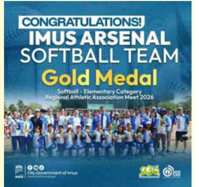
Imus Arsenal Softball Team, wagi sa kampeonato ng RAAM 2026: Muling pinatunayan ng Imus Arsenal Softball Team ang kanilang husay matapos masungkit ang Gold Medal sa Softball Elementary Category ng Regional Athletic Association Meet 2026 na ginanap sa San Miguel Open Field, Batangas City ngayong Huwebes, Marso 12, 2026. Sa isang kapana-panabik na laban, nanaig ang Imus Arsenal laban sa koponan ng Batangas Province sa puntos na 7-4 dahilang upang makuha nila ang ikalawang sunod na kampeonato sa prestihiyosong paligsahan. Muli ring irerepresenta ng koponan ang Imus sa Palarong Pambansa 2026. Ang kahanga-hanga tagumpay ng Imus Arsenal ay ipinagamamalagi ng Lungsod ng Imus. #LungsodNgImus #PrideOfImus