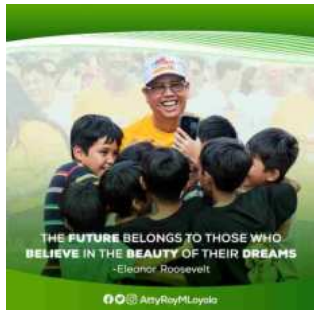
With every hug, we continue to build a brighter future—turning the dreams of every youth and citizen a reality. #AmaNgCarSiGMA #20thCongress #WeLoveCarSiGMA