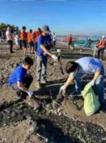
In celebration of World Water Day, volunteers from SM City Tanza — including employees, security guards, and maintenance personnel — came together for a meaningful coastal clean-up initiative at Barangay Julugan 1, Tanza Cavite, led by SM Cares in partnership with the Municipal Environment and Natural Resources Office. Through teamwork and shared responsibility, volunteers helped protect our shores and promote environmental awareness in the community — reminding us that caring for our waters today means a better tomorrow for all. #SMCaresCoastalCleanUps #SMWasteFreeFuture #EmpoweringCommunities