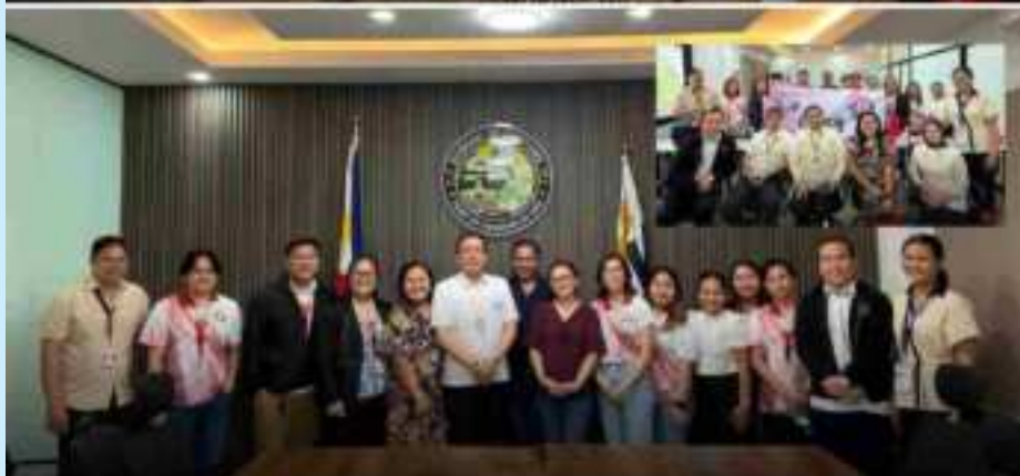
P1-BILLION VAPE BUST: Commissioner Ariel F. Nepomuceno and other Customs officials leads the presentation of massive quantities of smuggled vape products discovered in a Navotas City facility on March 21, 2026. Following intelligence from the CIIS-MICP, a composite team uncovered thousands of boxes lacking mandatory Philippine Standard (PS) licenses and Import Commodity Clearances. The seizure aligns with President Ferdinand R. Marcos Jr.'s directive to intensify the crackdown on illegal trade and protect Filipino consumers from unregulated goods. (BELOW PHOTO) BRIDGING ACADEMIA AND GOVERNANCE. Bureau of Customs Port of Cagayan de Oro District Collector Atty. Manuel O. Zurbito, Jr. (center), along with Deputy Collector Atty. Mohammad Ben-Usman, Piers and Inspection Chief Alinor P. Asum, and Administrative Chief Liz Lucelle P. Toston, hosts graduate students from Capitol University during an industry visit in Macabalan, CDO. The activity, aligned with Commissioner Ariel F. Nepomuceno's initiatives, provided Master's in Public Service Management students with insights into BOC operations, policy implementation, and best practices in public administration.