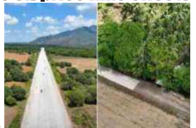
Left photo: The newly opened Lipa-Padre Garcia Bypass Road in Lipa City, Batangas. Right photo: the farm-to-market road project in Brgy. New Casay, Braulio E. Dujali, Davao del Norte. (Photos from DPWH)

Dizon also noted that they will address the lack of riprap and drainage systems in the area to prevent flooding and protect the farms and livelihoods of residents. (PNA)