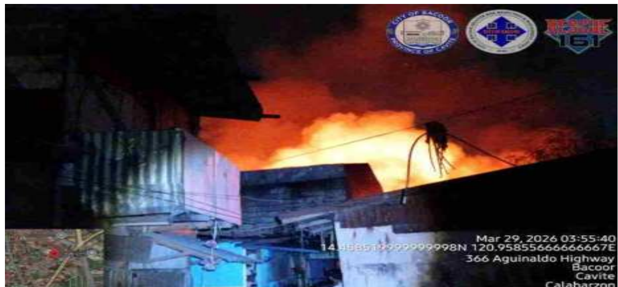
FIRE ADVISORY: Another fire incident has been recorded. Let's continue to remind everyone to be cautious and vigilant to avoid this kind of incident. Reminder to all: • Make sure LPG and appliances are turned off before leaving or going to bed • Avoid overloading the socket • Never leave a candle or cigarette burning • Watch out for items that can cause fire Safety begins in our own home. Be alert and responsible citizen. For an emergency, call 161 immediately. Let's all be careful.

In line with these efforts, Public Utility Jeepneys (PUJs) will continue to benefit from the Passada Card program, providing additional support to jeepneys operating along northern routes.