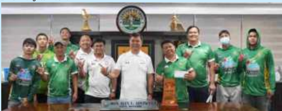
PEOPLE'S DAY: It is an important opportunity to personally listen and interact with our countrymen on People's Day. Our office will remain open to respond to grievances, suggestions, and needs of every Imuseño. #PeoplesDay #LungsodNgImus

Let your body rest, your mind breathe, and your stress melt away. Experience premium relaxation at home with K Infinity Home Service Massage & Spa. Because self-care isn't luxury — it's a necessity. Send us a message to reserve your slot Advance booking only.