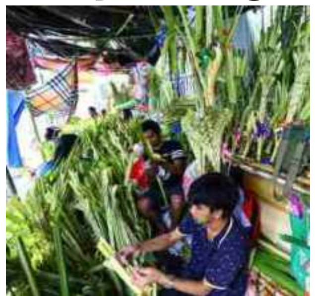
PALM ASSEMBLY. Vendors weave palaspas from fresh coconut and buri leaves outside Sto. Domingo Church in Quezon City on Saturday (March 28, 2026). President Ferdinand R. Marcos Jr. on Sunday (March 29) called on Filipinos to pause, reflect, and renew their faith as the country marks Palm Sunday and the start of Holy Week.

April 2 (Maundy Thursday) and April 3 (Good Friday) have been declared regular holidays, while April 4