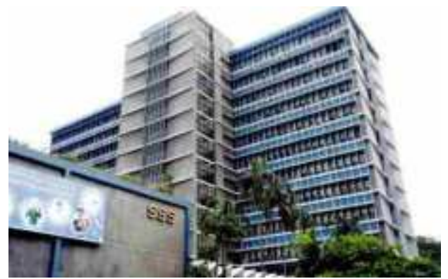
Social Security System Office in Quezon City

“SSS remains committed to protecting the welfare