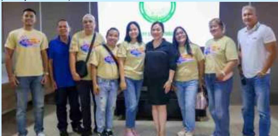
Courtesy Visit of FEBMS Alumni Representatives in preparation for the 50th Founding Anniversary of Francisco E. Barzaga Memorial School and the Grand Alumni Homecoming. #SulongNaSulongPaDasmariñas #OnwardForwardCityofDasmariñas