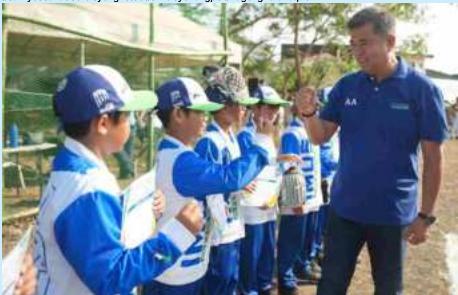
We joined the opening of the Tanzang Luma Inter Color Softball Tournament held at Villa Nicacia Subdivision in Tanzang luma 3, together with our continuous promotion of sports activities in our city. Through such activities, our countrymen are given the opportunity to showcase their talents and maintain an active lifestyle. To all contestants, I wish you success and may fair play and respect prevail. #LungsodNgImus