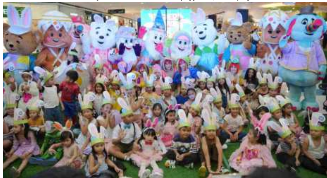
Kids at SM City Dasmariñas share big smiles and even bigger Easter fun

Easter came alive across SM City Dasmariñas, SM City Trece Martires, and SM City Tanza with a fun-filled Character Parade that delighted families and kids alike. Colorful costumes, exciting activities, and cheerful moments filled the malls as everyone gathered to celebrate a truly egg-s-tra special day together.