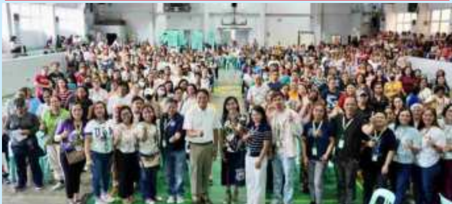
Naipamahagi na ngayong araw ang unang quarter na subsidy para sa ating mga solo parent. #SaDiyosSaTaoSerbisyongTotoo #sErbisyoLangPO #BagongParañaque

Vol. XV: No. 40 P10 CIRCULATED NATIONWIDE April 15 - 21, 2026