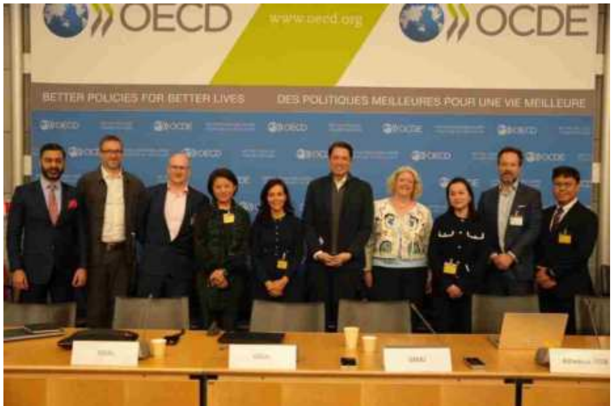
SMAI, the developer of the New Manila International Airport in Bulacan, joined Atradius Dutch State Business and the project's Independent Social and Environment Consultants at the 12th OECD Workshop for Financial Institutions in Paris in February.