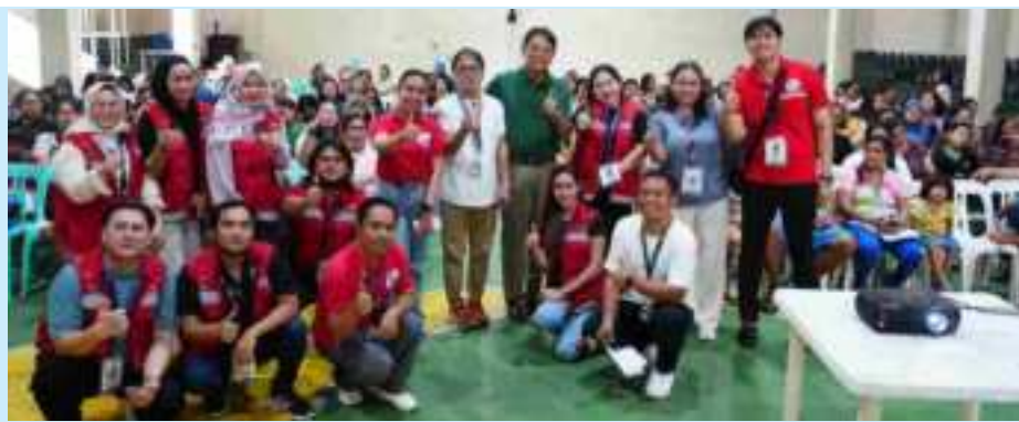
Thank you very much to everyone who advances and supports the Tara Basa Program of the City Government of Parañaque especially to our parents who aspire to have a dream education for their children. Please join me for the fulfillment of this mission. #SaDiyosSaTaoSerbisiyongTotoo #sErbisyoLangPO #BagongParañaque