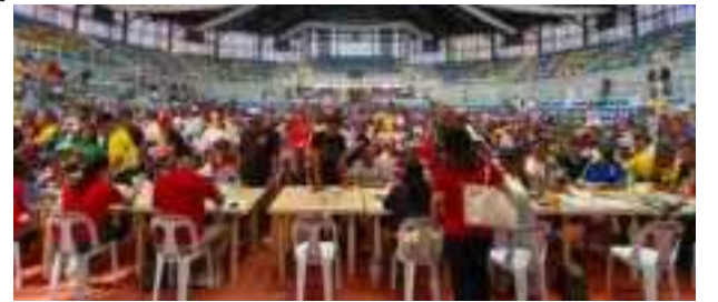
CASH RELIEF. Department of Social Welfare and Development 6 (Western Visayas) personnel release cash relief assistance to tricycle drivers at the Barotac Nuevo Arena in Barotac Nuevo, Iloilo, on Thursday (April 16, 2026). The DSWD is eyeing to serve 47,135 tricycle drivers in various municipalities in the region.

She explained that the CRA beneficiaries are PUV drivers from the list submitted to the agency by the local government units (LGUs) for tricycle and jeepney drivers; Land Transportation Franchising and Regulatory Board (LTFRB) for Transport Network Vehicle Service (TNVS) drivers; and Department of Information and Technology