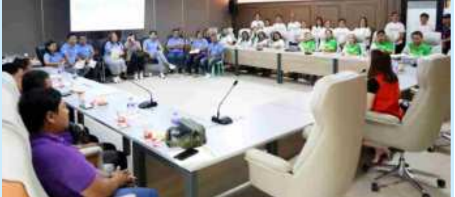
Oathtaking Ceremony of Mabuhay City Homeowners Association Inc., The Promenade Homeowners Association Inc., Terra Alta Homes Homeowners' Association Inc., First United Homeowners' Association Inc., and Tierra Bonita Homeowners Association Inc. #OnwardForwardCityofDasmariñas #SulongNaSulongPaDasmariñas