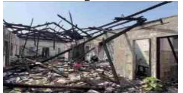
GUTTED. The gutted remains of the Basco Central School in Basco, Batanes, in this undated photo. The Department of Public Works and Highways on Friday (April 17, 2026) committed to starting the reconstruction of the heritage school this year.

"We will speed up the works, and next year, it will be completed."