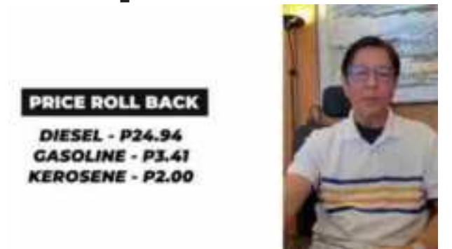
President Ferdinand R. Marcos Jr. announces a bigger fuel price rollback next week in a taped video message released on Saturday (April 18, 2026).

"Batid namin ang sitwasyon ng bawat Pilipino sa panahong ito. Hindi tayo titigil. Hindi tayo uulong. At hindi natin hahayaan na ang ginawang ito ay hindi po