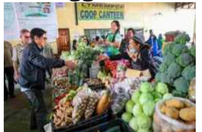
President Ferdinand R. Marcos Jr. visits the Benguet Agri-Pinoy Trading Center in La Trinidad, Benguet on Friday (April 17, 2026).

The initiative is part of the national government's ongoing efforts to provide food support and help farmers by sourcing produce directly from agricultural areas such as Benguet.