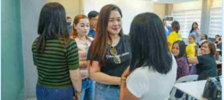
Orientation on Anti-Violence Against Women and Their Children Act of 2004 (RA 9262) for Solo Parents 15 April 2026: In solidarity with our City Government of Trece Martires in the celebration of National Solo Parents Week, the City Social Welfare and Development Office (CSWDO) conducted Orientation on Anti-Violence Against Women and Their Children Act of 2004 (RA 9262) for solo parents yesterday at the City Health Office Operation Center. The aim of this activity is to increase the knowledge of the participants about their rights and the mechanisms of protection against any kind of violence. Knowledge of the law is a weapon. By disseminating the right information, women and solo parents are empowered to fight for their rights and safety. #SoloParentsSupport #GADMandateAwareness #AntiVAWC #LGUTreceMartires