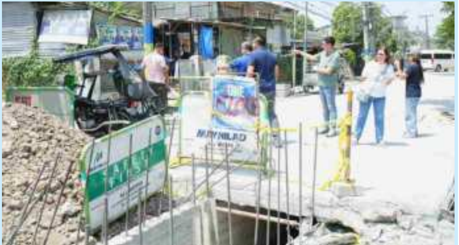
MEDICION 2-F DRAINAGE IMPROVEMENT AND ROAD REHABILITATION: We had a thorough inspection of the on-going Medicion 2-F Drainage Improvement and Road Rehabilitation to ensure the smooth implementation of the project. The purpose of this is to provide a long-term solution to the flood problem in the area and to improve the road condition for a smoother travel of our countrymen. We are making sure that this project will be finished before the rainy season arrives so that the Imuseños can immediately feel the comfort it brings. #LungsodNglmus