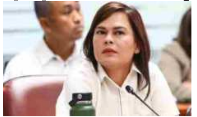
Vice President Sara Duterte