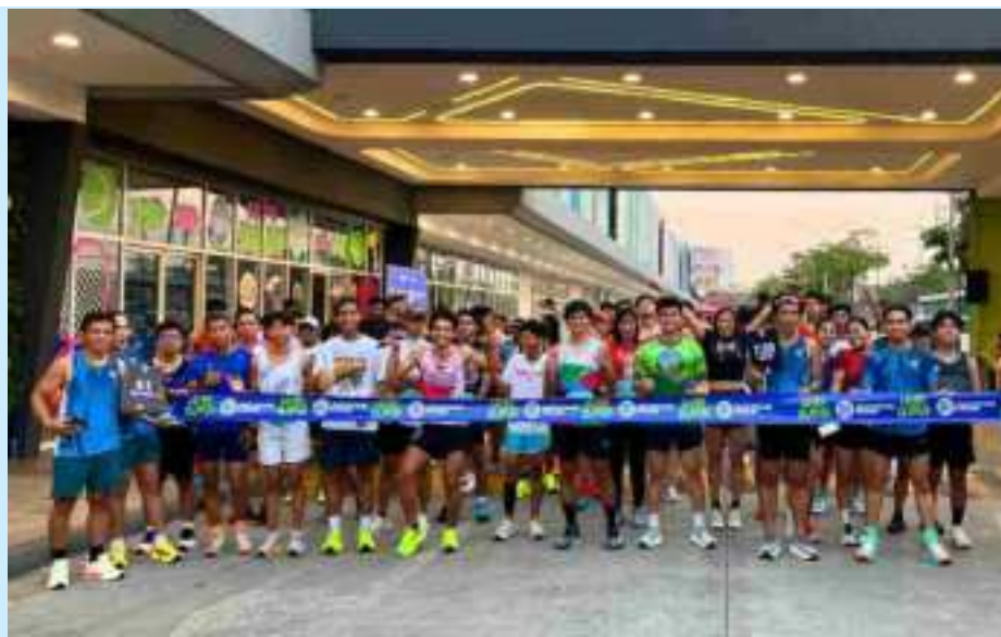
SM City Tanza recently held its SUPER FAM RUN, bringing together families, friends, and fitness enthusiasts for a day of wellness and community spirit.