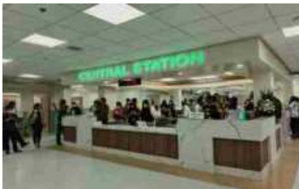
Corazon Locsin Montelibano Memorial Regional Hospital in Bacolod City

The bill also tasks the Department of Health, in