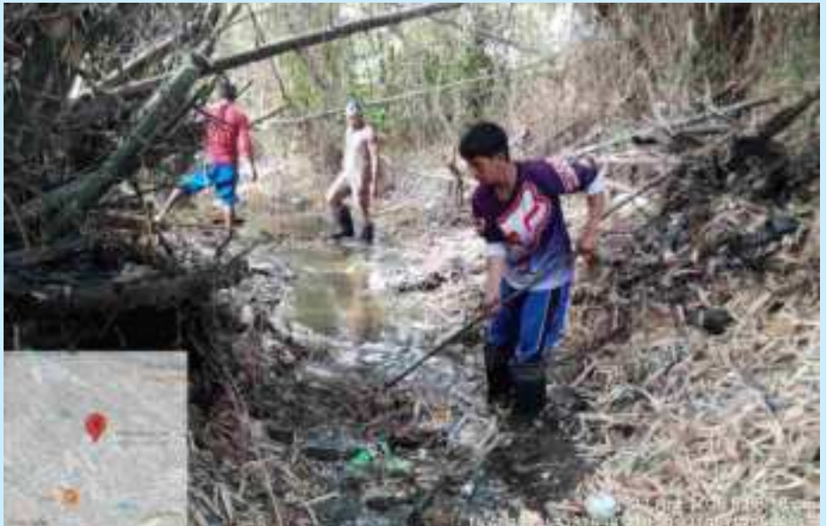
Strike sa Kalikasan: Sama-sama tayong kumilos para sa mas malinis at mas ligtas na kapaligiran—river cleanup at bamboo trimming para maiwasan ang pagbaha at mapanatili ang ganda ng ating kalikasan. Sa pagkakaisa, kayang-kaya nating alagaan ang ating bayan!