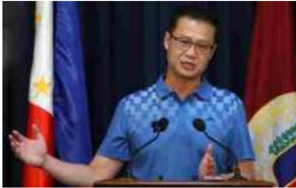
Senator Sherwin Gatchalian

He said the measure has precedent, noting that similar relief mechanisms were implemented during the