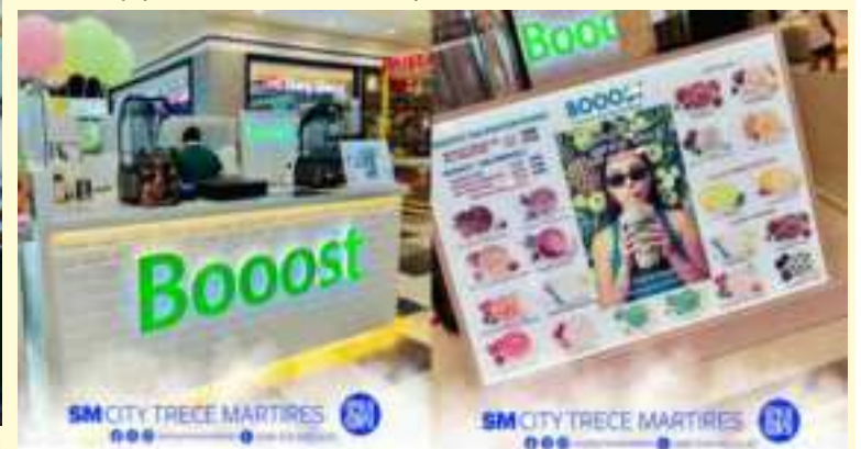
BOOST Now Open at SM City Trece Martires: Fitness enthusiasts and mall-goers can now enjoy a healthier way to recharge as BOOST officially opens at SM City Trece Martires. Known for its protein-packed shakes and refreshing blends, the newest addition offers a convenient option for those with active lifestyles. Shoppers are invited to fuel up and experience a refreshing boost while enjoying their visit at the mall.

Remember, you may choose your sin, but you cannot choose the consequences.