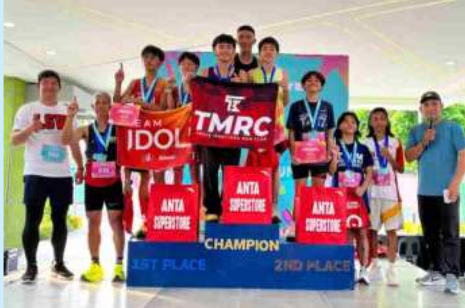
The event featured an energetic morning of running activities, culminating in joyful finish line moments that highlighted camaraderie and shared achievement. Participants of all ages filled the venue with enthusiasm, turning the run into a celebration of health, unity, and fun.