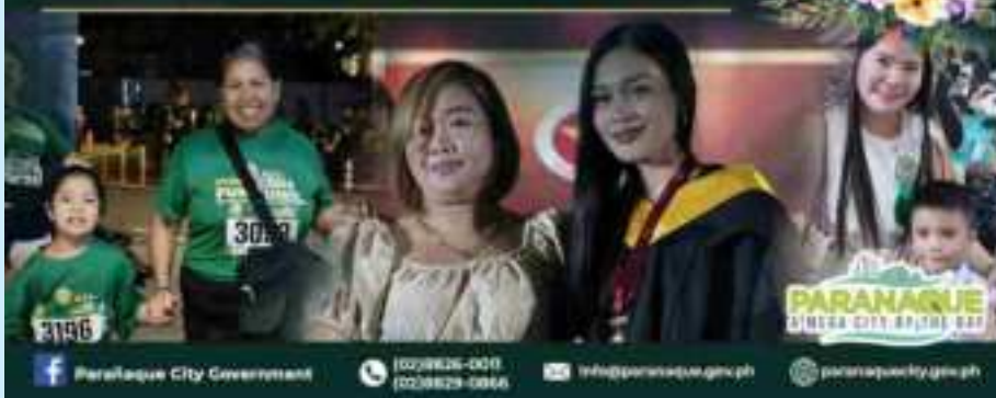
Our heartfelt greetings to all Mothers in Paranaque City. You are truly the light of the home, the guide in every journey and the joy in all occasions! #SaDiyosSaTaoSerbisyongTotoo #sErbisyoLangPO #bagongparanaque