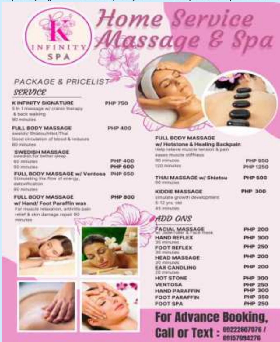
Let your body rest, your mind breathe, and your stress melt away. Experience premium relaxation at home with K Infinity Home Service Massage & Spa. Because self-care isn't luxury — it's a necessity. Send us a message to reserve your slot Advance booking only.