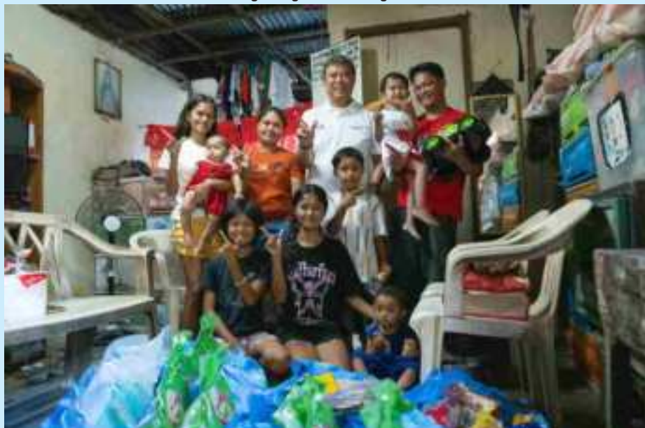
Some children at a very young age go through great trials, but still fight with a smile and full of hope despite everything. And in times like these, the City Government is ready to rest and help in their wake.