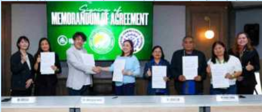
MOA Signing with Gonbee Co., Ltd and TESDA Provincial Training Center to promote quality training and international employment opportunities, while ensuring the protection, welfare, and professional development of Filipino Workers. #OnwardForwardCityofDasmariñas #SulongNaSulongPaDasmariñas