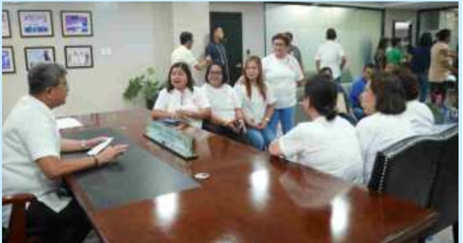
Multi po tayong nakinang at tumugon sa mga hinaing at pangangailangan ng ating mga kababayan sa isinagawang People's Day. Patuloy nating ipadadama ang isang gobyernong handang umalalay, may malasakit at konkretong aksyon para sa lahat. Maraming salamat po sa inyong tiwala at patuloy na pakikiisa. #PeoplesDay #LungsodNgImus