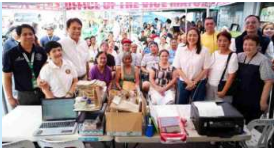
Our countrymen no longer need to go to the Pharmacy of Parañaque because Alagang Parañaque on Wheels will bring them medicine and other medical services. #SaDiyosSaTaoSerbisyongTotoo #sErbisyoLangO #BagongParanaque