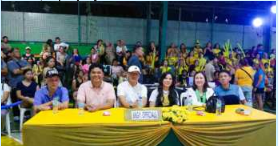
A celebration of beauty, confidence, and community spirit during the Barangay Buroil Main Gandang NGO 2026 held at the Summerwind IV Covered Court, Brgy. Buroil Main #OnwardForwardCityofDasmariñas #SulongNaSulongPaDasmariñas