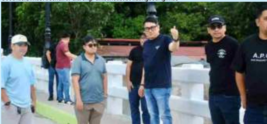
Navarro-Alapan Bridge Inspection: Kasama ang ating Engineering Team, binisita at sinuri po natin ang tulay na magkokonekta sa Brgy. Navarro, General Trias City at Brgy. Alapan II-B, Imus City sa bisperas ng inagurasyon nito. Sa sandaling mabuksan ang nasabing tulay, inaasahan pong mas magiging mabilis, maayos, at maginhawa ang biyahe ng mga motoristang dadaan sa bahaging ito ng Cavite. #LetsJoinForces for better connectivity in General Trias! #InfrastructureDevelopment #RoadConnectivity #SDG9IndustryInnovationAndInfrastructure #AlagangGenTri