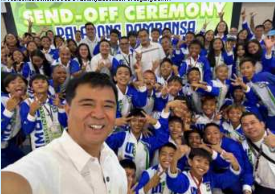
Selfie kasama ang mga susunod na kampeon sa Palarong Pambansa 2026! Good luck, Atletang Imuseño! Good luck, Imus Arsenal! #PalarongPambansa2026 #LungsodNgImus