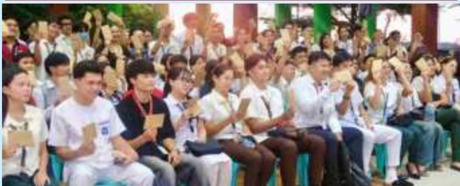
Each of the 165 GenTriseño beneficiaries of "Every Town Will Benefit" Presidential Scholars received the P20,000 educational assistance from the National Government. The goal of this grassroots scholarship program of the government is to reach out assistance to college students in every barangay in support of their studies. #LetsJoinForces #GeneralTriasPeoplesDay #BawatBayanMakikinabang #PresidentialScholars #SDG4QualityEducation #AlagangGenTri

Vol. XV: No. 46 P10 CIRCULATED NATIONWIDE May 27 - June 2, 2026