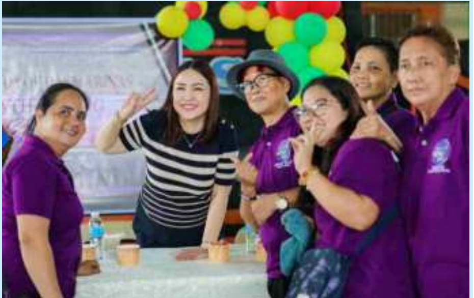
Oath-taking Ceremony of the Friends of Dasmariñas - Brgy. Sta. Lucia Chapter held at the Brgy. Sta. Lucia Covered Court #OnwardForwardCityofDasmariñas #SulongNaSulongPaDasmariñas