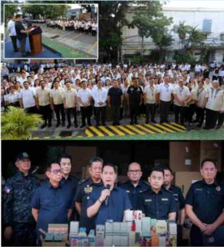
BUILDING A STRONGER BOC: Bureau of Customs Commissioner Ariel F. Nepomuceno leads the oath-taking ceremony of 165 newly hired and promoted BOC personnel. The mass appointment—consisting of 120 new hires and 45 promoted employees—is a key part of the bureau's operational and administrative buildup under its Integrity, Accountability, and Modernization (IAM) Movement. (BELOW PHOTO) CRACKDOWN ON ILLICIT TRADE: Personnel from the Bureau of Customs (BOC), led by MICP District Collector Geoffrey de Vera and the Customs Intelligence and Investigation Service (CIIS-MICP), in coordination with the Philippine Coast Guard (PCG), inspect a portion of the P841 million worth of counterfeit perfumes and lotions seized from a Valenzuela City warehouse. The massive operation, commended by BOC Commissioner Ariel F. Nepomuceno, forms part of the directive of President Ferdinand R. Marcos Jr. to intensify border protection and disrupt illicit supply chains distorting fair trade in the country.