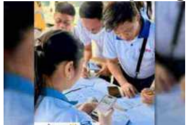
HEALTH PROTECTION FOR SCHOOL OPENING. Personnel from the Philippine Health Insurance Corporation (PhilHealth) assist Department of Education (DepEd) employees and teachers during a registration activity under the Yaman ng Kalusugan or YAKAP Program at the Gabaldon Central School in Nueva Ecija on Monday (June 1, 2026). The PhilHealth has partnered with the DepEd during the annual Brigada Eskwela to roll out health protection services ahead of the June 8 school opening.

Eligible beneficiaries may register for the YAKAP program using the eGov App or by visiting PhilHealth Local Health Insurance Offices. (PNA)