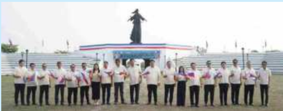
PAGPUPUGAY SA IKA-128 ANIBERSARYO NG ARAW NG KALAYAAN: Ang Pamahalaang Lungsod ng Imus ay nakikiisa sa paggunita ng ika-128 anibersaryo ng Araw ng Kalayaan. Ating alalahanin at parangalan ang tapang at sakripisyo ng ating mga bayani na nagbigay-daan sa kalayaang tinatamasa natin ngayon. Patuloy nating isabuhay ang pagmamahal sa bayan, pagkakaisa, at malasakit sa kapwa. Mabuhay ang Pilipinas! #NationalFlagDay #Watawat2026 #Kalayaan2026 #LabananSaAlapan #LungsodNgImus

Vol. XV: No. 49 P10 CIRCULATED NATIONWIDE June 17 - 23, 2026