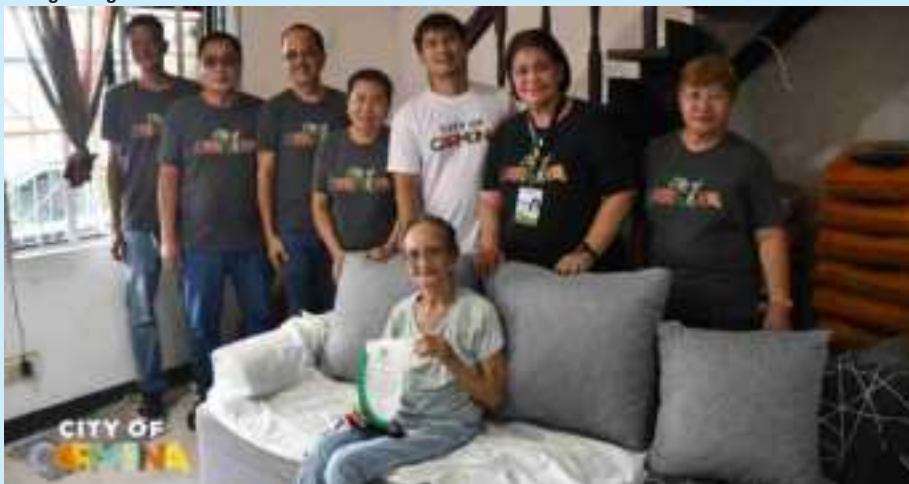
Long live Nonagenarians of the City of Carmona! Two of our beloved nonagenarians or grandparents of our City aged 90-99 years old were visited in their homes by your servant together with the City Council Members. We are gladly awarded the Plaque of Recognition and one-time incentive of PHP 50,000.00 in accordance with our ordinance. You can hope that the City Government is always on hand for the welfare of every marginalized and vulnerable sectors like the elderly. May you enrich this small offering by the Local Government. #CityOfCarmona #LungsodNgCarmona #LGUCarmona #BayanMunaLagi #DapatAngatLahat