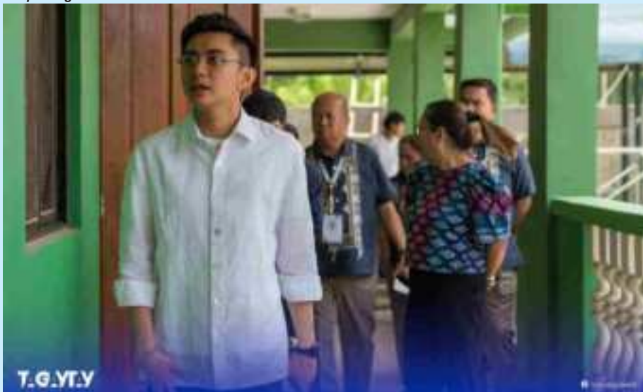
We recently checked on the progress of one of the new elementary school buildings being constructed for our city. Once completed, this facility will be able to accommodate approximately 330 additional students, helping ease classroom congestion and provide a better learning environment for our young learners. Investing in education remains one of the most important responsibilities of our administration. By building new classrooms and educational facilities, we are not only addressing the needs of today's students but also laying the foundation for the future of our city. #BatangTagaytay #BayanihanTagaytay