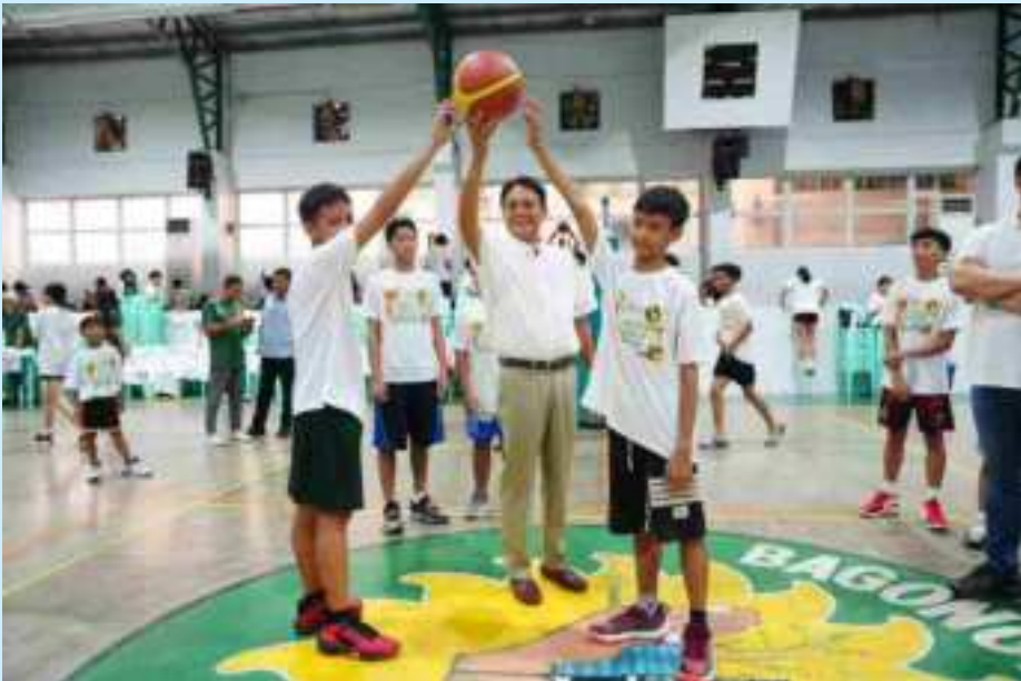
Break muna sa aral! Isang masayang pagkakataon para sa ating mga kabataan na matuto, mahubog ang kanilang talento, at magkaroon ng bagong karanasan sa ating Parañaque Sports Camp. Good luck at enjoy, mga anak! #SaDiyosSaTaoSerbisyonngTotoo #sErbisyoLangpo #bagongparanaque