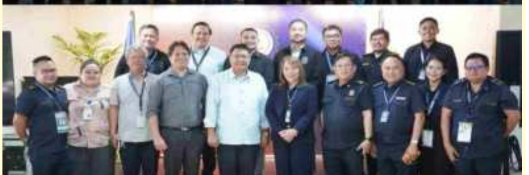
P1.7-BILLION SMUGGLED CIGARETTE SEIZURE: Key officials and representatives from the Bureau of Customs, NBI, (BIR, and PCG conduct an inspection of 23 seized containers filled with approximately 29,900 master cases of illicit, untaxed cigarettes. The massive joint operation, which intercepted the misdeclared goods in Tondo, Manila, and aboard the vessel ASC BIG BOY, was launched following critical intelligence acted upon by BOC Commissioner Ariel F. Nepomuceno. Present during the inspection are IG Deputy Commissioner PMGen Emmanuel Luis D. Licup (Ret.), NBI Director Melvin A. Matibag, DOF Undersecretary Rolando T. Ligon, and PCG Rear Admiral Christopher Meniado. They are accompanied by BOC EG Deputy Commissioner PBGen. Nolasco Bathan (Ret.), CIIS Director Thomas Narcise, ESS Director Noel Estanislao, MIPC District Collector Atty. Geoffrey De Vera, and MIPC-CIIS Chief IO3 Joel Pinawin, alongside representatives from the National Tobacco Administration. (LOWER PHOTO) BOC-Port of Cebu District Collector Alexandra Yap-Lumontad and Mactan Economic Zone (MEZ) Zone Administrator Mr. Arnel M. Suyu lead a coordination meeting aimed at streamlining customs processes and enhancing support for PEZA locators. Aligned with the directives of Commissioner Ariel F. Nepomuceno, the meeting focused on accelerating trade facilitation while ensuring strict border compliance. Also in photo were Depcol for Operations Dr. Jesus G. Llorando, Support of Mactan Collector Gerardo A. Campo, Appraiser Atty. Evangeryl A. Muñoz, Law Division Chief Atty. Orland Marc S. Luminarias, ESS-CPD District Commander SP/CAPT. Abdila S. Maulana, Jr., CIIS Chief IOIII Carlo A. Bautista and Passenger Service Chief Jay A. Oyao.