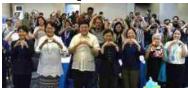
HEALTH AS A HUMAN RIGHT. The Philippine Health Insurance Corporation and the Commission on Human Rights lead health and social justice advocates alongside civil society organizations during a learning forum in Quezon City on Tuesday (June 23, 2026). The collaboration aims to strengthen domestic healthcare delivery through a rights-based framework and expand preventive and primary care access via PhilHealth's Yaman ng Kalusugan Program.

"Through PhilHealth YAKAP, we are transforming our healthcare system to ensure that primary and preventive care are accessible to every Filipino, regardless