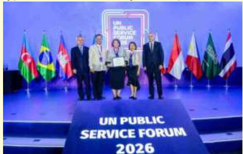
Congratulations, City of Carmona! Ang pagkilalang ito ay sumasalamin sa ating adhikaing walang kahit sinoman ang maiwan dahil Bayan Muna Lagi at Dapat Angat Lahat.

Remember, you may choose your sin, but you cannot choose the consequences.