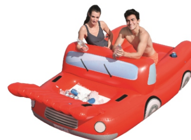
Chill with friends and family in this amazing Big Red Truck Lounge.

floaters at Toy Kingdom. These amazing summer treats are available at Toy Kingdom Express outlets in The SM Stores and Toy Kingdom stores in most SM Supermalls. Also visit www.toykingdom.ph and follow ToyKingdomPH at Facebook for more updates.