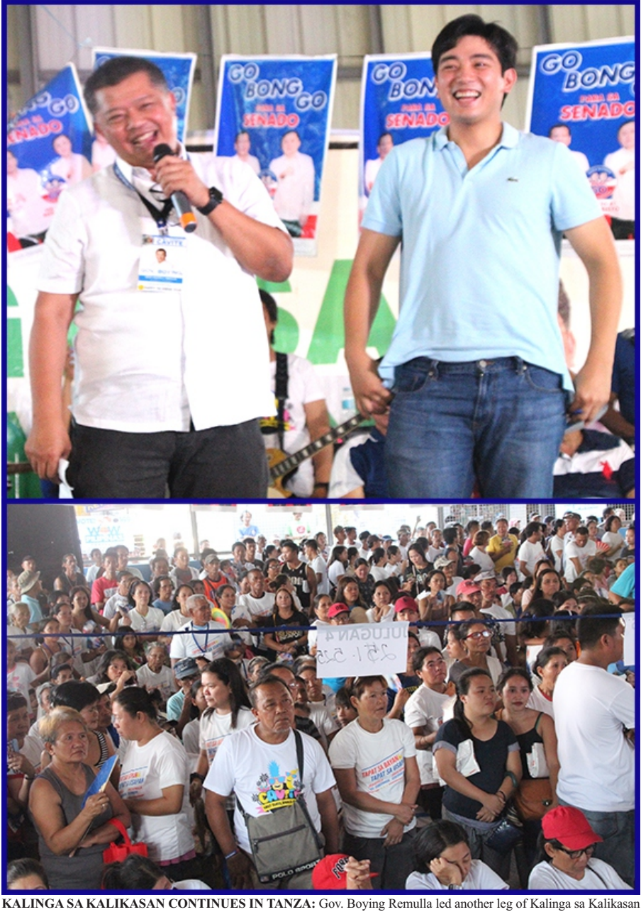
KALINGA SA KALIKASAN CONTINUES IN TANZA: Gov. Boying Remulla led another leg of Kalinga sa Kalikasan program in Julugan I, Tanza on March 28, 2019. The environmental awareness campaign was also attended by Vice-Governor Jolo Revilla, Gov. Jonvic Remulla and Indang Municipal Councilor Ping Remulla. Mayor Yuri Pacumio together with the Sangguniang Bayan Members and the residents of Tanza expressed appreciation to the provincial government and Gov. Remulla for the continuous support to their municipality. (PICAD)

All products are created using the finest ingredients sourced from the four corners of the globe, which are not tested on animals and are 100% vegetarian. The Body Shop has been in the Philippine market for eighteen years with over 55 strategically located stores nationwide.