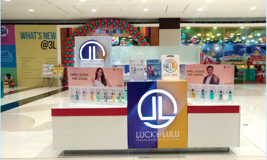
LUCKY LULU SCENTS is the newest trend when it comes to fragrances. Handcrafted perfumes made to suit your personality. All types of scents are available for his and her. Wear it and you'll "smell good. Feel good." Visit Lucky Lulu at 3rd level of SM City Bacoor.