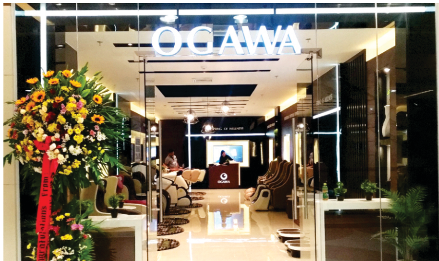
Want to have your own masseur at home anytime of the day? Visit OGAWA, well-known for its expertise in manufacturing massage chairs that provide relaxation and total wellness to you and your family. Visit its newly opened store at the 2nd level of SM City Bacoor.