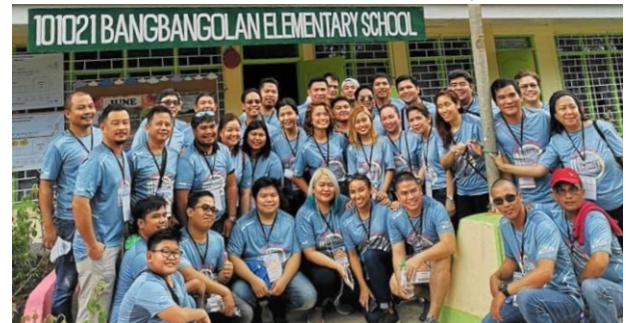
Bayer employees cooked, packed and distributed 500 food packs to elementary school children in San Fernando, La Union

Delegates expressed their gratitude to Japan for the latter's support in capacity building for ASEAN and its member states. Japan, on the other hand, affirmed its firm resolve to address the illegal shipment of waste from other countries.