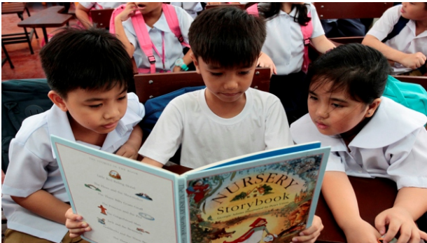
Kids started to read books donated by The SM Store.

The SM Share Movement Donate-a-Book campaign is part of The SM Store's quarterly donation drives- wherein it collects shoes, books,