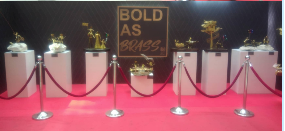
BOLD AS BRASS @ SM CITY DASMARIÑAS