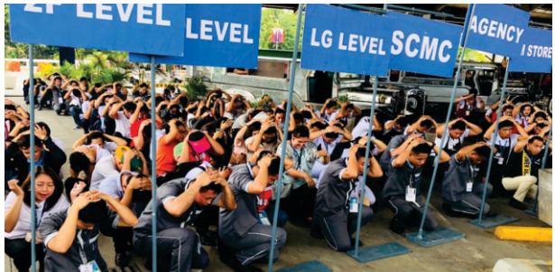
SM City Dasmariñas' employees together with its tenants once again participated in the National Simultaneous Earthquake Drill 2019. Headed by the Mall Operations, Customer Relations Service and Emergency Response Group of SM City Dasmariñas in cooperation with Dasmariñas CDRMO, the drill was successfully concluded. The drill aimed to prepare the people for the coming of the BIG ONE which nobody knows when and where to occur. It encouraged customers' participation as well, so that they would know what to do in case it happens, most especially when they are inside an establishment.