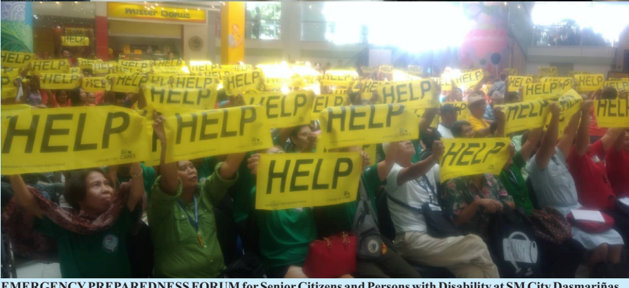
EMERGENCY PREPAREDNESS FORUM for Senior Citizens and Persons with Disability at SM City Dasmariñas.